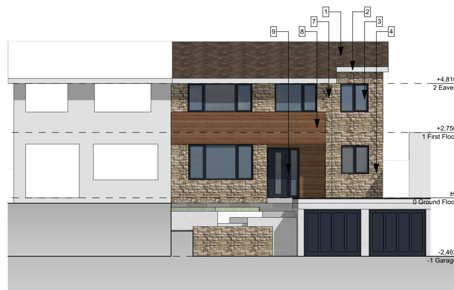
Proposed NE Elevation