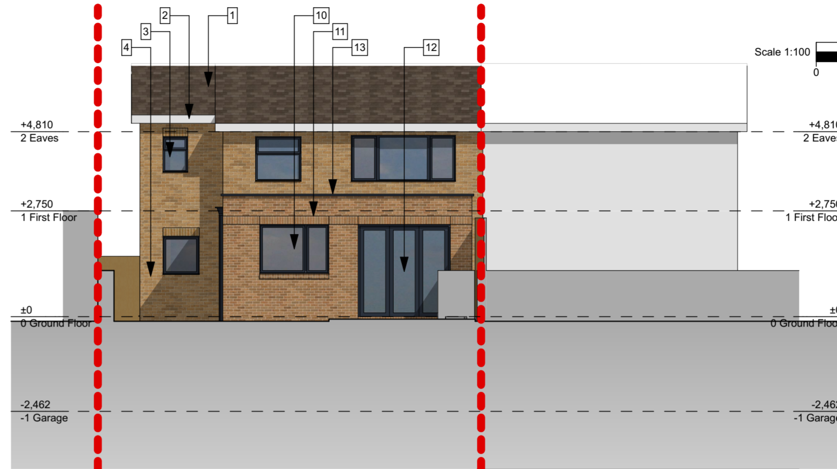
Proposed SW Elevation