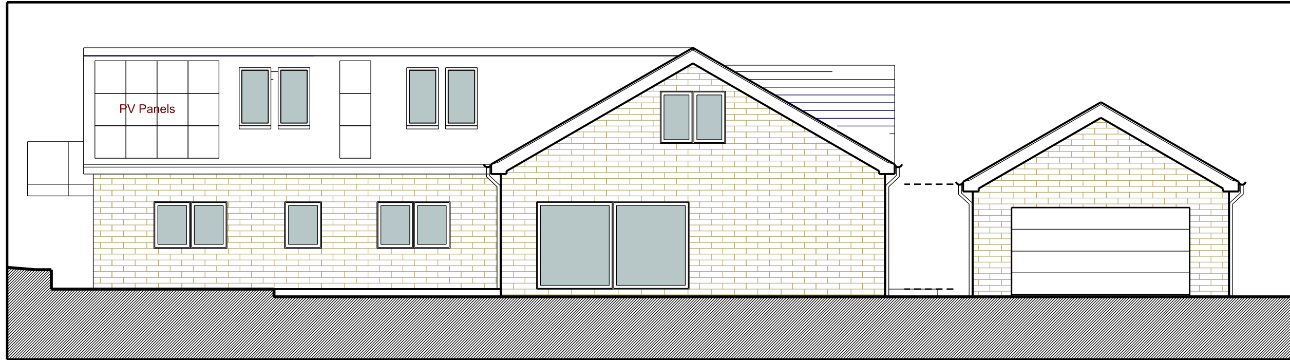
South Elevation - Proposed