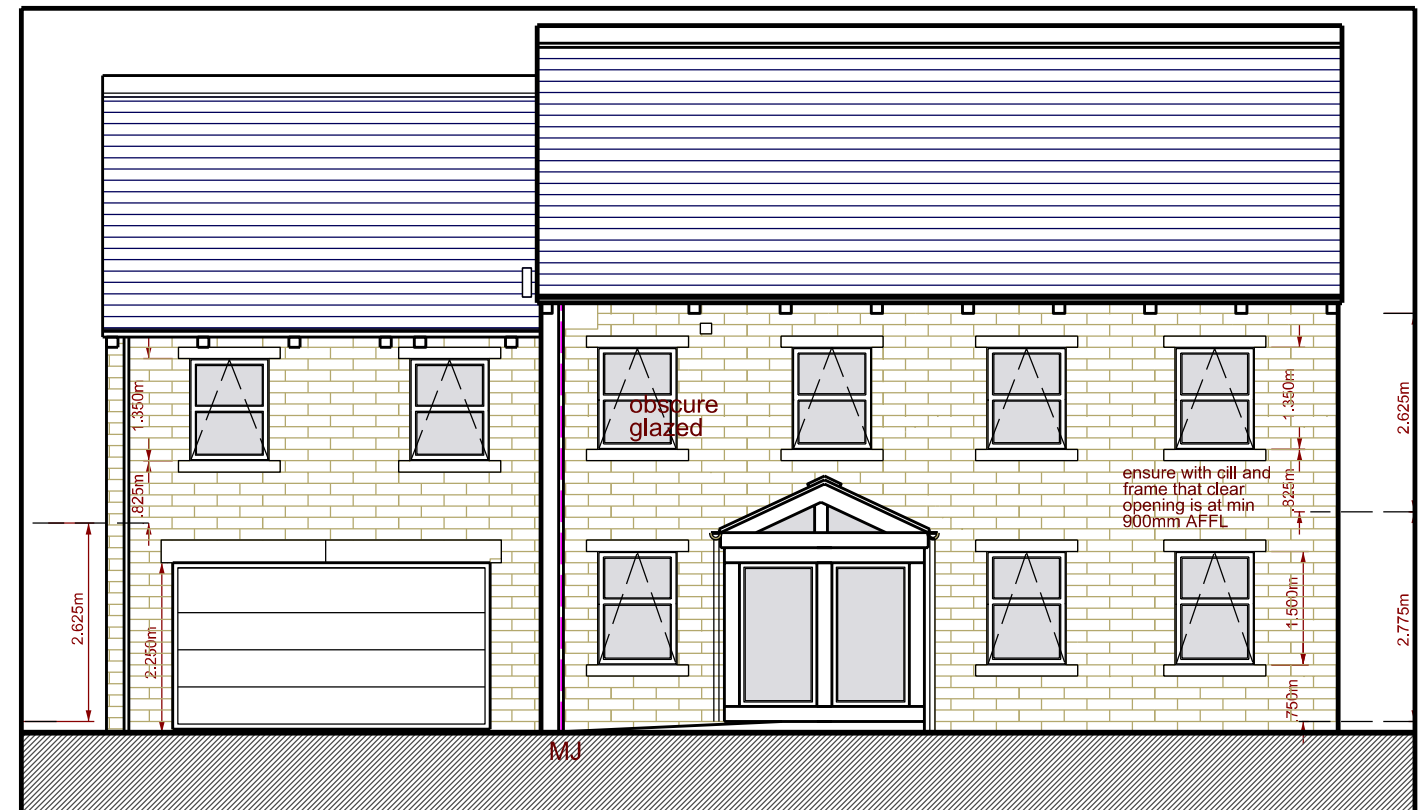
Dwelling 1 West Elevation - Proposed