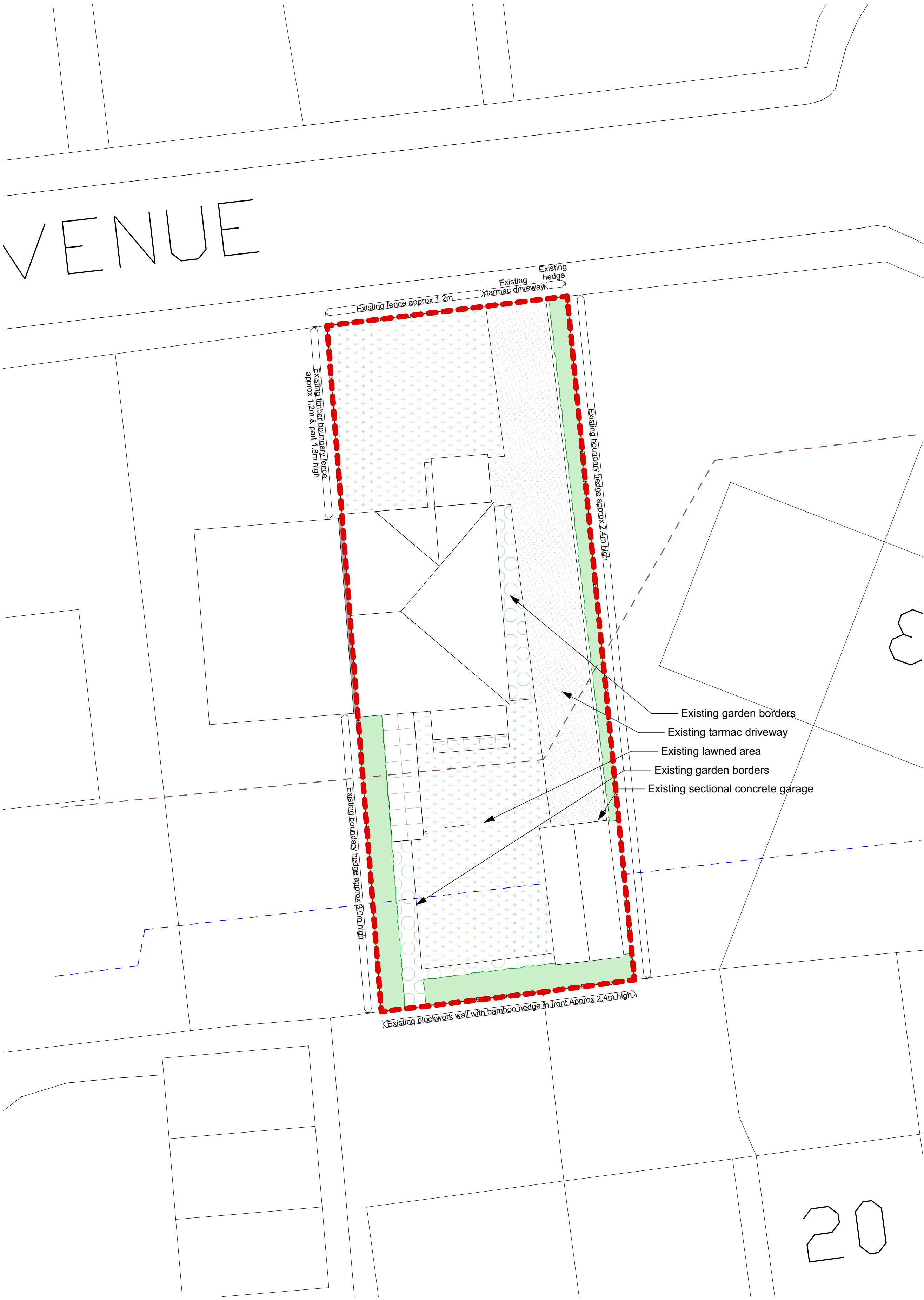
Existing Site Plan