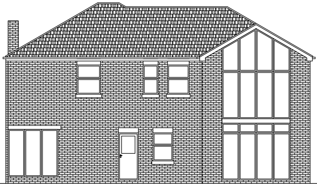
PROPOSED REAR ELEVATION SCALE 1:100 AT A3