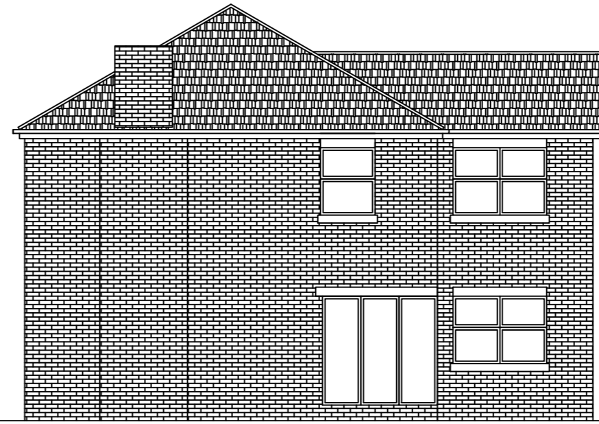
PROPOSED END ELEVATION SCALE 1:100 AT A3