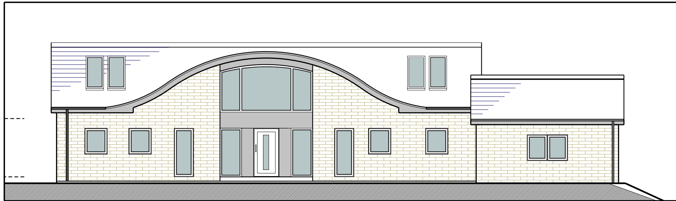
East Elevation - Proposed