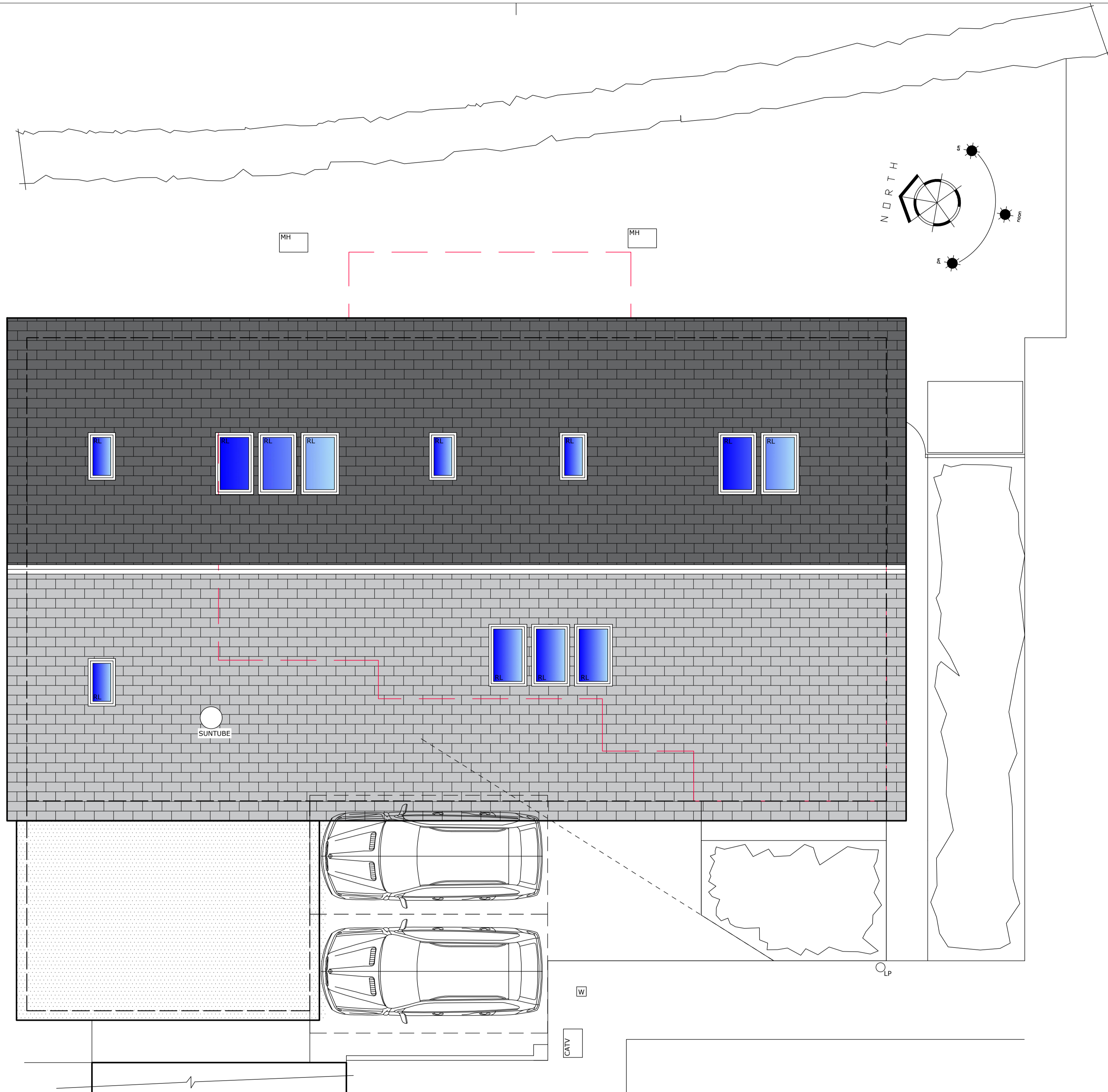
SITE PLAN SCALE 1:50