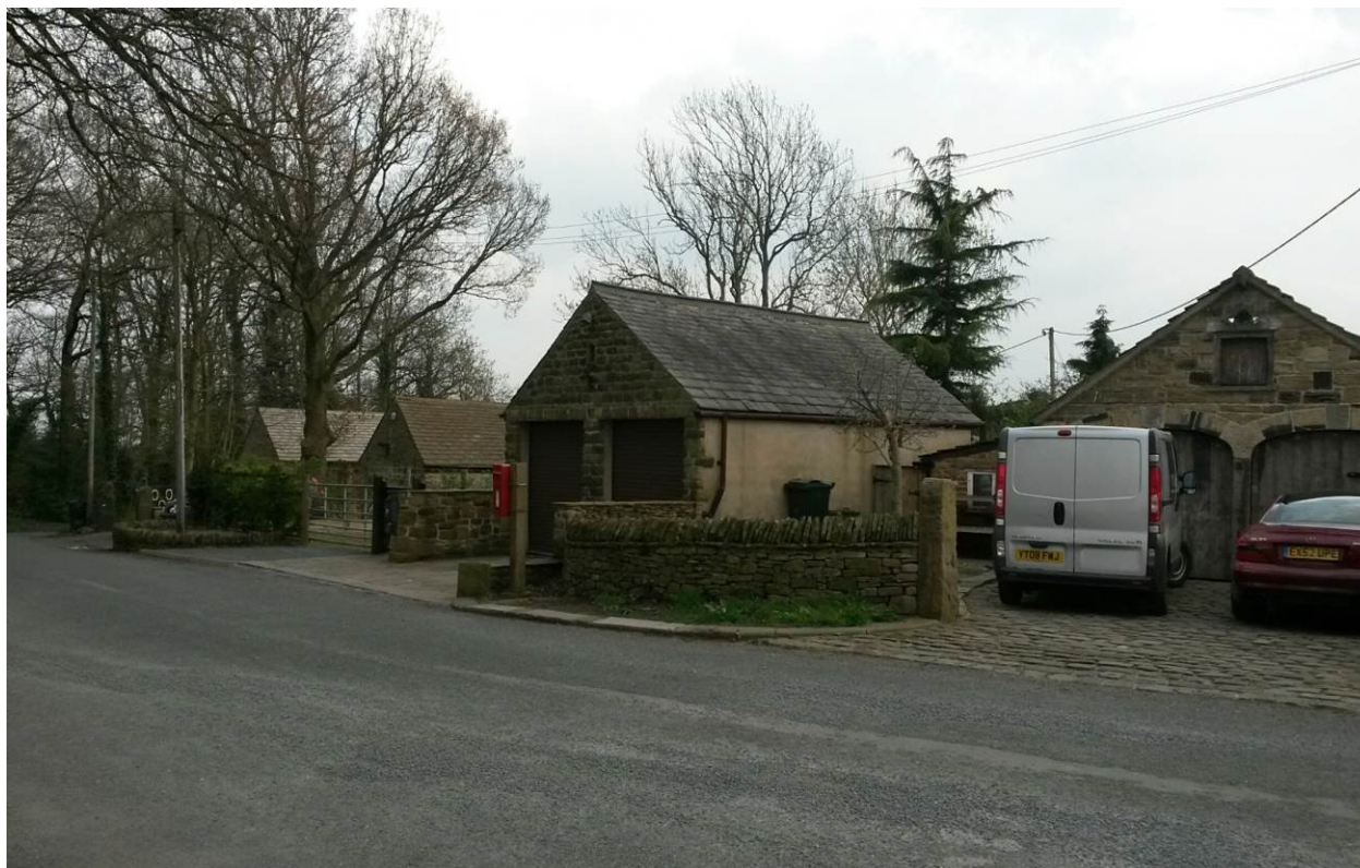
Fig 01. View of access and adjacent garages and parking on Spout House Lane looking south.