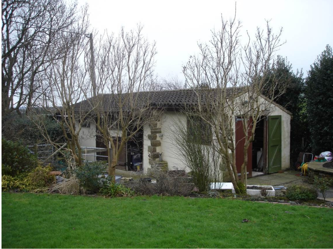
Fig 6. View of stables and workshop looking south.