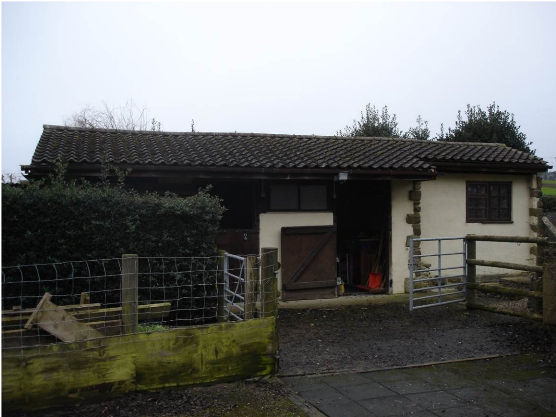
Fig 03. North East Elevation of stables.