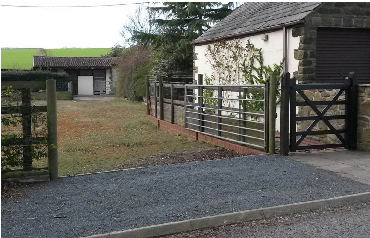
Fig 02. View of existing access with Stables to rear.