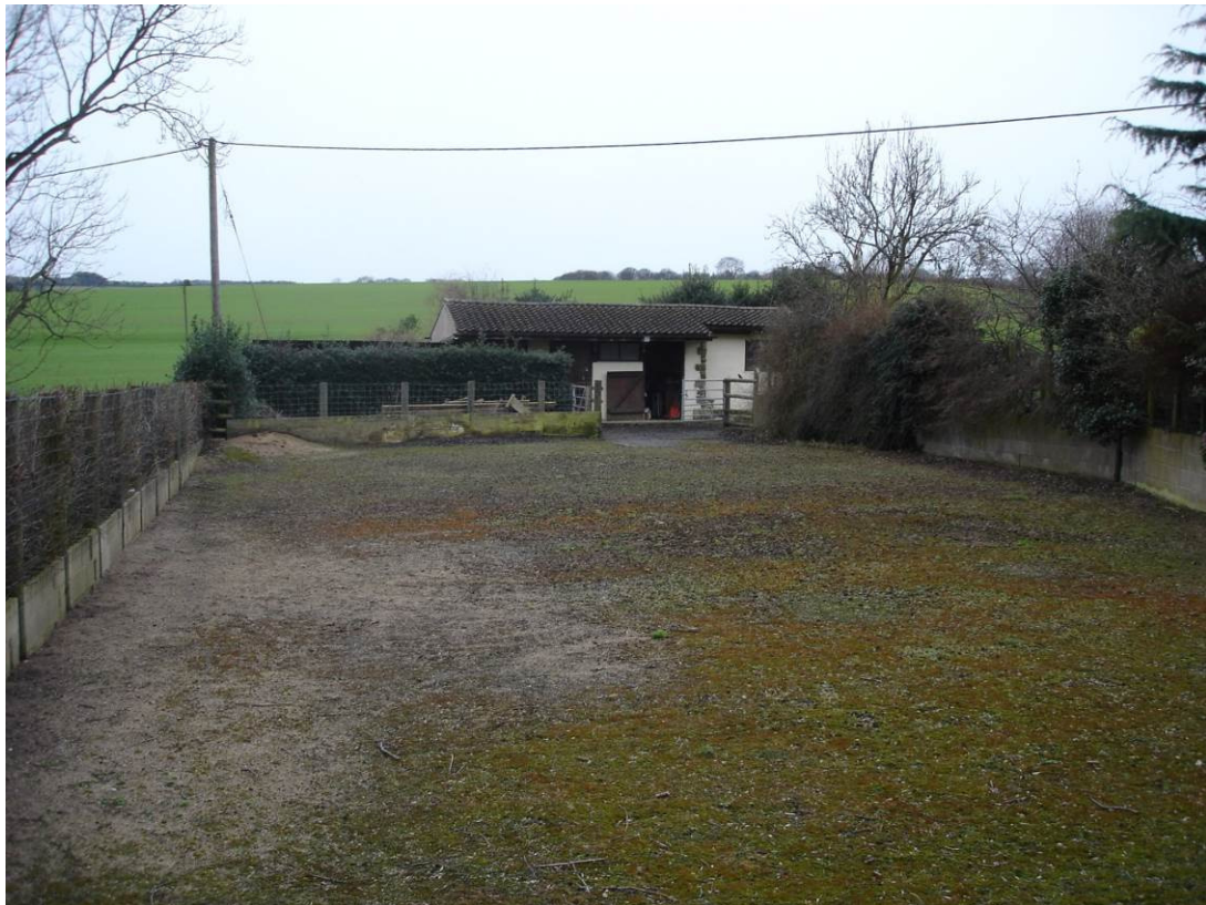
Fig 7. Exercise area to front (north) of stables, looking south west.