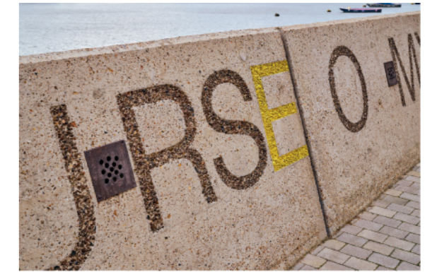
Sandblasted wall artwork by Hardscape Surfaces for 'London Unto the Sea' Thames Path North East Extension, Isle of Dogs, London.