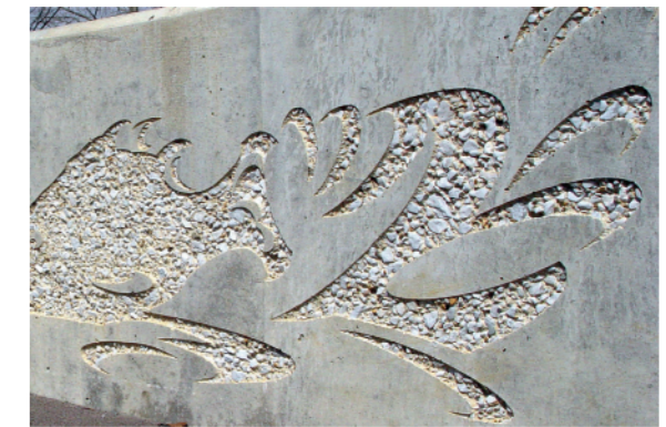
Sandblasted wall artwork on the Metro Center Levee flood mitigation wall in Nashville, Tennessee, USA.