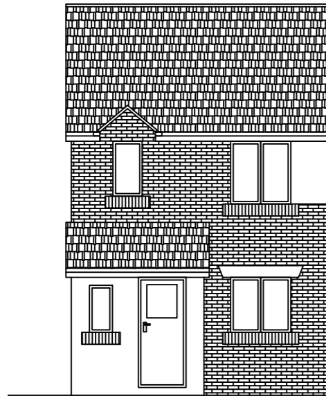
EXISTING FRONT ELEVATION SCALE 1:100 AT A3