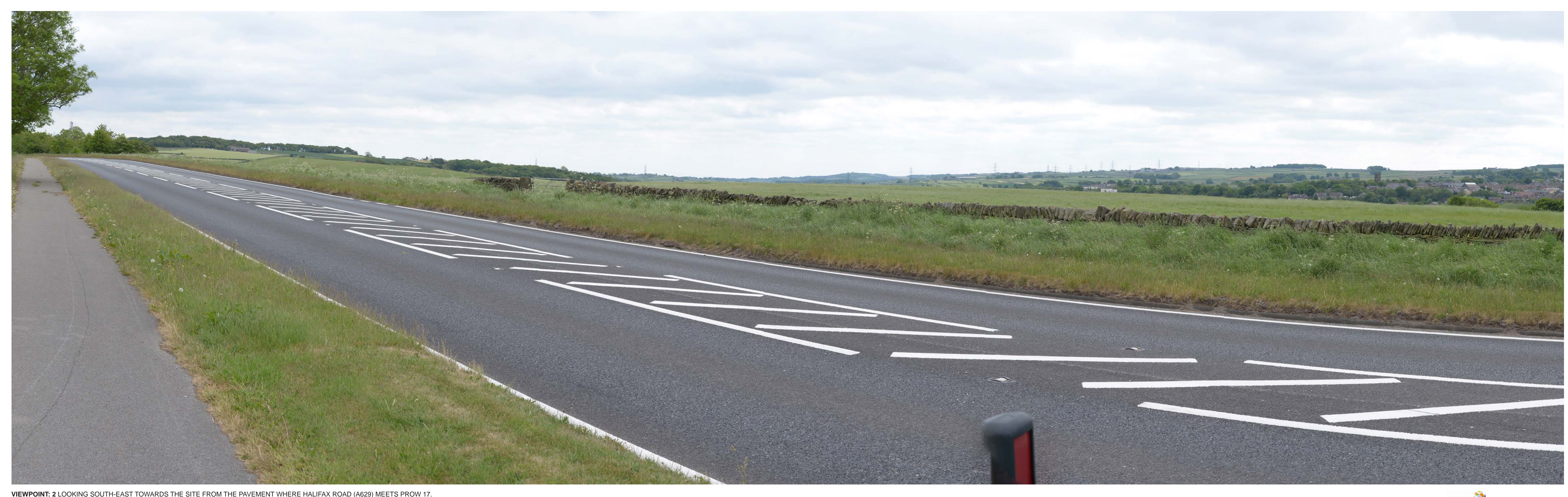
VIEWPOINT: 2 LOOKING SOUTH-EAST TOWARDS THE SITE FROM THE PAVEMENT WHERE HALIFAX ROAD (A629) MEETS PROW 17.

DATE AND TIME OF PHOTOGRAPHY: 26/05/2020 AT 11:55 ENLARGEMENT FACTOR: 96% AT A1 MAKE AND MODEL OF CAMERA: NIKON D610 VIEW AT COMFORTABLE ARM'S LENGTH MAKE AND FOCAL LENGTH OF LENS: NIKON 50MM HORIZONTAL FIELD OF VIEW: 90° DIRECTION OF VIEW: SOUTH-EAST