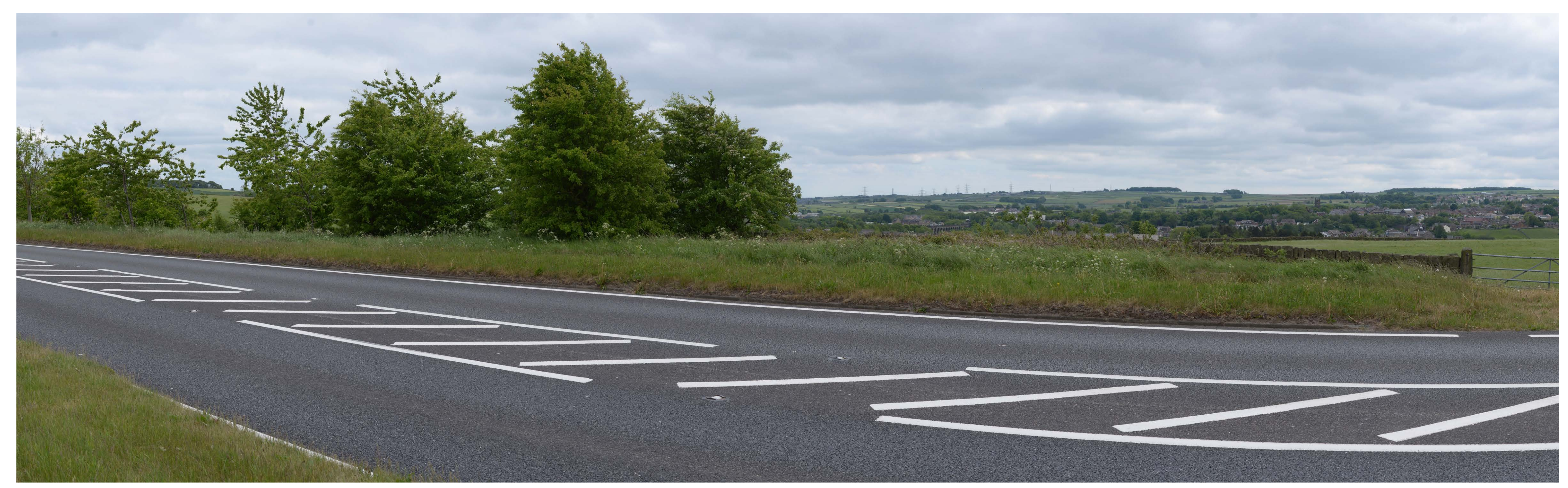
VIEWPOINT: 3 LOOKING SOUTH TOWARDS THE SITE FROM THE PAVEMENT ALONG HALIFAX ROAD (A629).

ENLARGEMENT FACTOR: 96% AT A1 MAKE AND MODEL OF CAMERA: NIKON D610 VIEW AT COMFORTABLE ARM'S LENGTH MAKE AND FOCAL LENGTH OF LENS: NIKON 50MM DIRECTION OF VIEW: SOUTH HORIZONTAL FIELD OF VIEW: 90° TO BE PRINTED AT A1 FOR ASSESSMENT PURPOSES