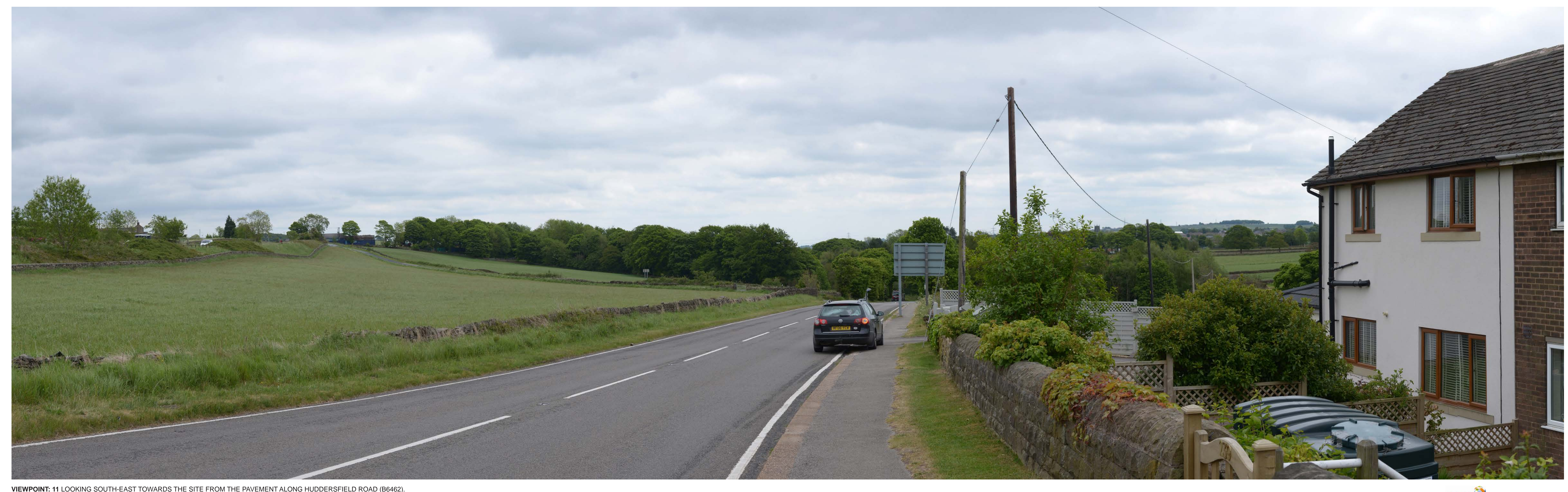
VIEWPOINT: 11 LOOKING SOUTH-EAST TOWARDS THE SITE FROM THE PAVEMENT ALONG HUDDERSFIELD ROAD (B6462).

DATE AND TIME OF PHOTOGRAPHY: 26/05/2020 AT 12:10 ENLARGEMENT FACTOR: 96% AT A1 MAKE AND MODEL OF CAMERA: NIKON D610 VIEW AT COMFORTABLE ARM'S LENGTH MAKE AND FOCAL LENGTH OF LENS: NIKON 50MM HORIZONTAL FIELD OF VIEW: 90° DIRECTION OF VIEW: SOUTH-EAST TO BE PRINTED AT A1 FOR ASSESSMENT PURPOSES