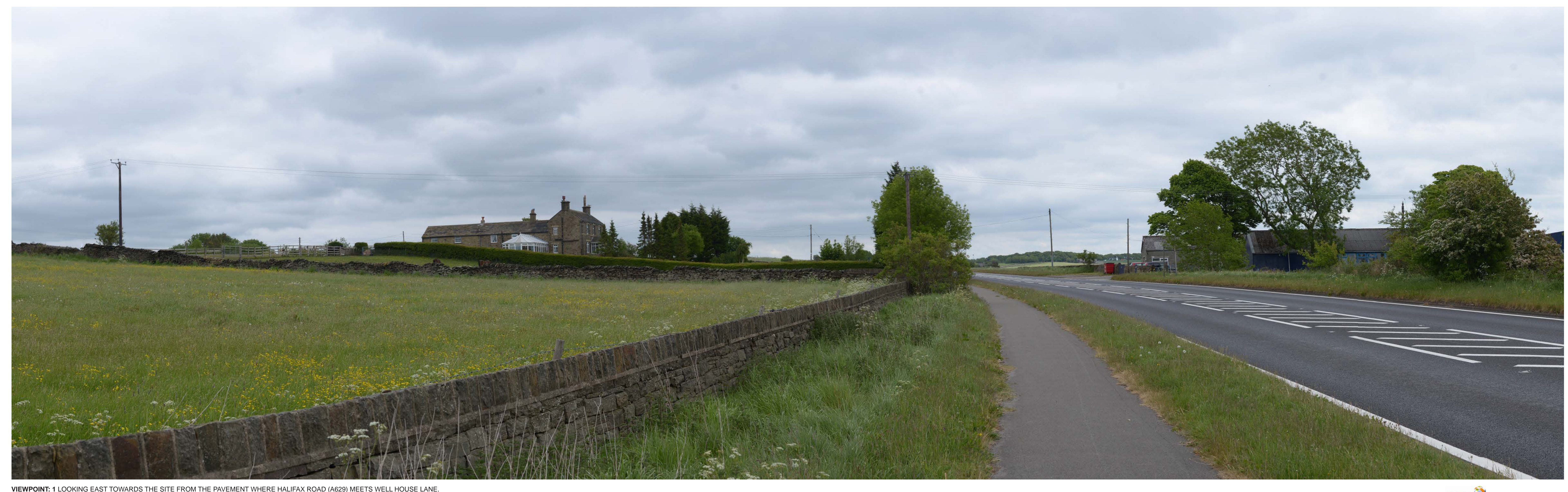
VIEWPOINT: 1 LOOKING EAST TOWARDS THE SITE FROM THE PAVEMENT WHERE HALIFAX ROAD (A629) MEETS WELL HOUSE LANE.

DATE AND TIME OF PHOTOGRAPHY: 26/05/2020 AT 12:00 ENLARGEMENT FACTOR: 96% AT A1 MAKE AND MODEL OF CAMERA: NIKON D610 VIEW AT COMFORTABLE ARM'S LENGTH MAKE AND FOCAL LENGTH OF LENS: NIKON 50MM HORIZONTAL FIELD OF VIEW: 90° DIRECTION OF VIEW: EAST TO BE PRINTED AT A1 FOR ASSESSMENT PURPOSES