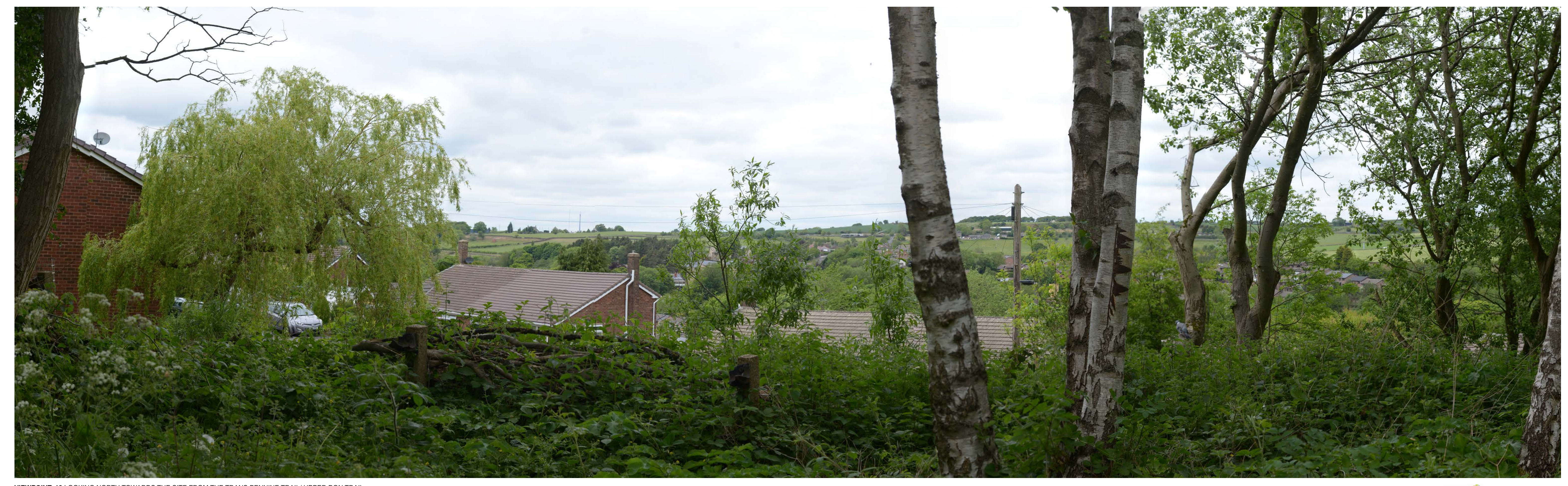
VIEWPOINT: 18 LOOKING NORTH TOWARDS THE SITE FROM THE TRANS PENNINE TRAIL/ UPPER DON TRAIL.

DATE AND TIME OF PHOTOGRAPHY: 26/05/2020 AT 13:00 ENLARGEMENT FACTOR: 96% AT A1 MAKE AND MODEL OF CAMERA: NIKON D610 VIEW AT COMFORTABLE ARM'S LENGTH MAKE AND FOCAL LENGTH OF LENS: NIKON 50MM HORIZONTAL FIELD OF VIEW: 90° DIRECTION OF VIEW: NORTH TO BE PRINTED AT A1 FOR ASSESSMENT PURPOSES