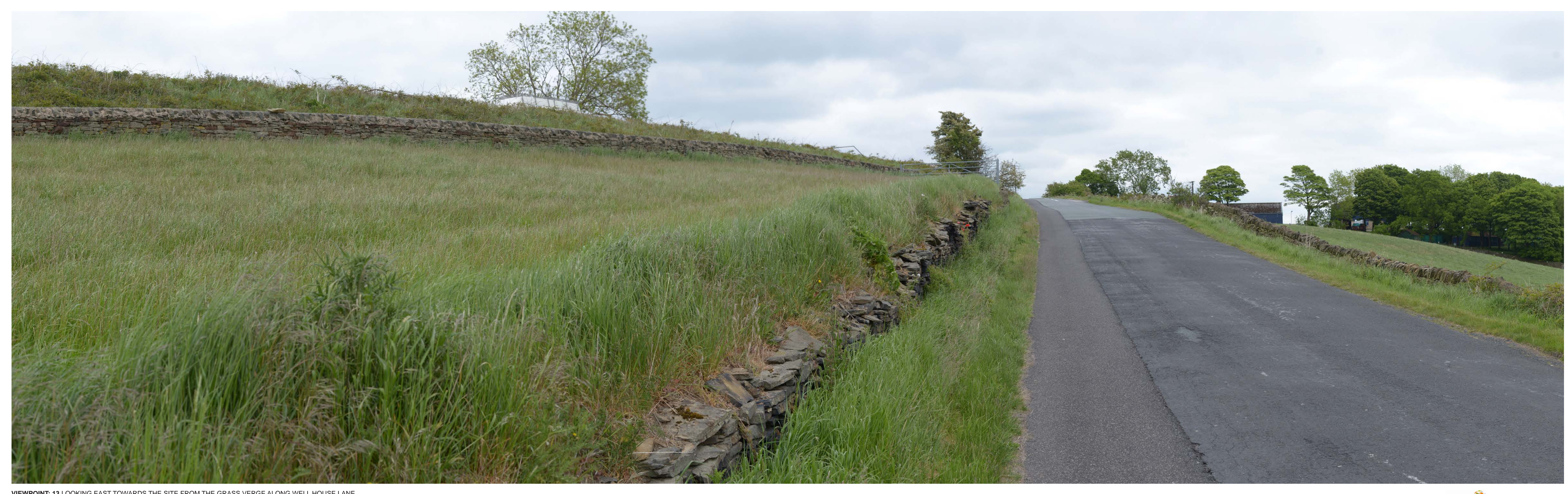
VIEWPOINT: 13 LOOKING EAST TOWARDS THE SITE FROM THE GRASS VERGE ALONG WELL HOUSE LANE.

DATE AND TIME OF PHOTOGRAPHY: 26/05/2020 AT 12:00 ENLARGEMENT FACTOR: 96% AT A1 MAKE AND MODEL OF CAMERA: NIKON D610 VIEW AT COMFORTABLE ARM'S LENGTH MAKE AND FOCAL LENGTH OF LENS: NIKON 50MM HORIZONTAL FIELD OF VIEW: 90° DIRECTION OF VIEW: EAST TO BE PRINTED AT A1 FOR ASSESSMENT PURPOSES