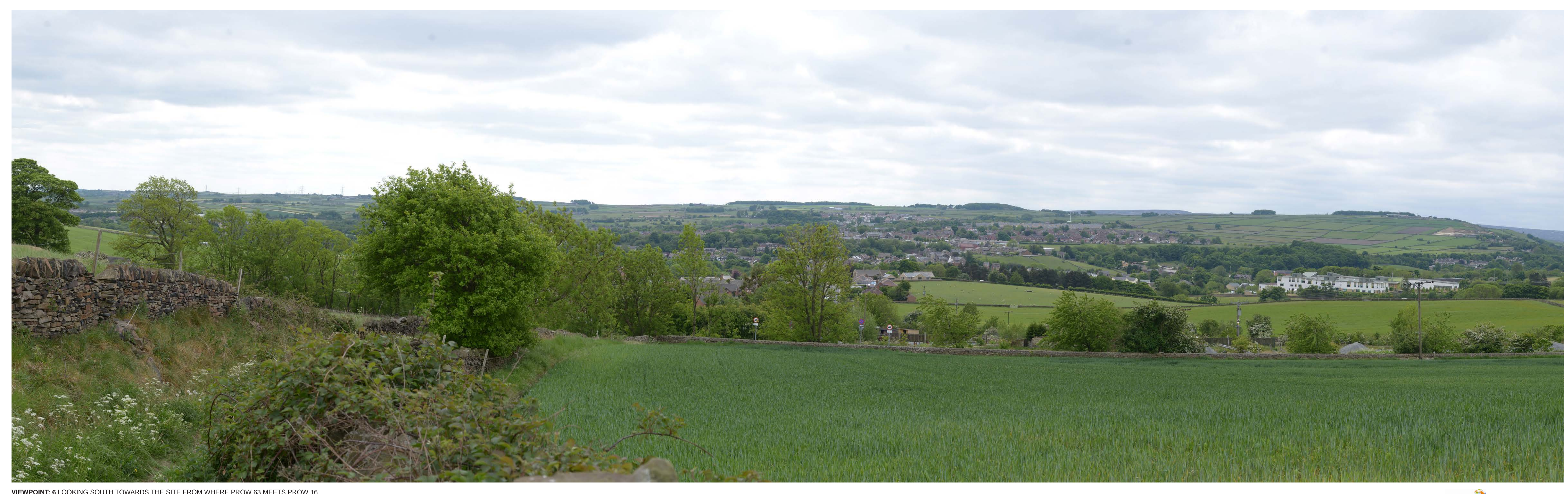
VIEWPOINT: 6 LOOKING SOUTH TOWARDS THE SITE FROM WHERE PROW 63 MEETS PROW 16.

DATE AND TIME OF PHOTOGRAPHY: 26/05/2020 AT 11:35 ENLARGEMENT FACTOR: 96% AT A1 MAKE AND MODEL OF CAMERA: NIKON D610 VIEW AT COMFORTABLE ARM'S LENGTH MAKE AND FOCAL LENGTH OF LENS: NIKON 50MM HORIZONTAL FIELD OF VIEW: 90° DIRECTION OF VIEW: SOUTH