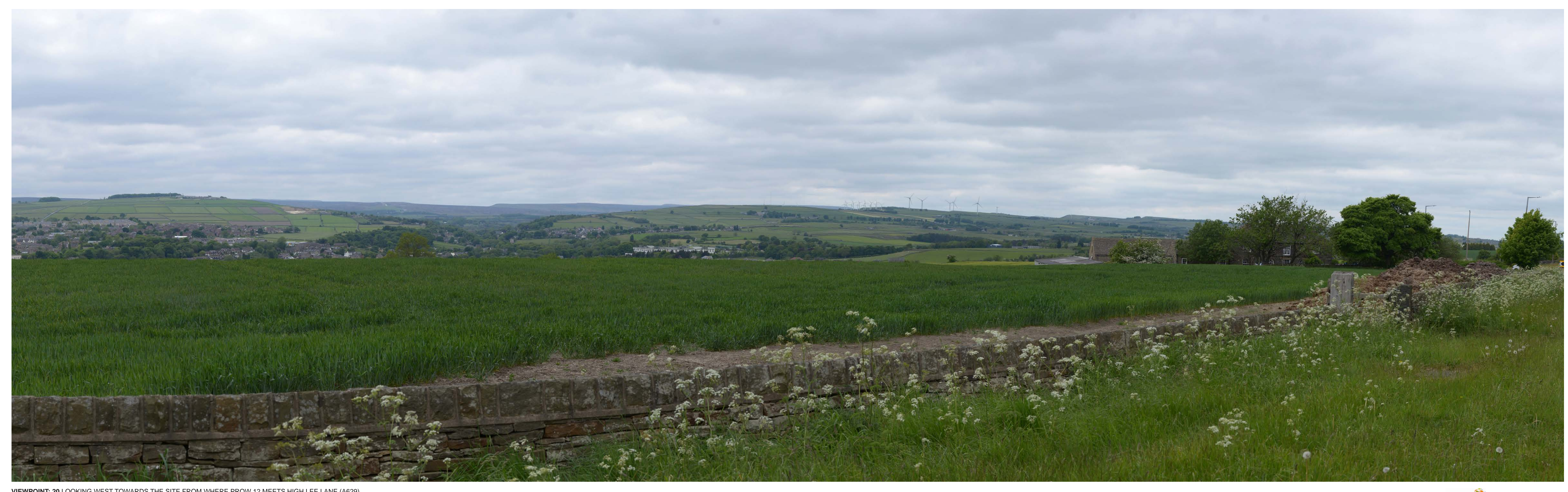
VIEWPOINT: 20 LOOKING WEST TOWARDS THE SITE FROM WHERE PROW 12 MEETS HIGH LEE LANE (A629).

DATE AND TIME OF PHOTOGRAPHY: 26/05/2020 AT 13:55 ENLARGEMENT FACTOR: 96% AT A1 MAKE AND MODEL OF CAMERA: NIKON D610 VIEW AT COMFORTABLE ARM'S LENGTH MAKE AND FOCAL LENGTH OF LENS: NIKON 50MM HORIZONTAL FIELD OF VIEW: 90° DIRECTION OF VIEW: WEST