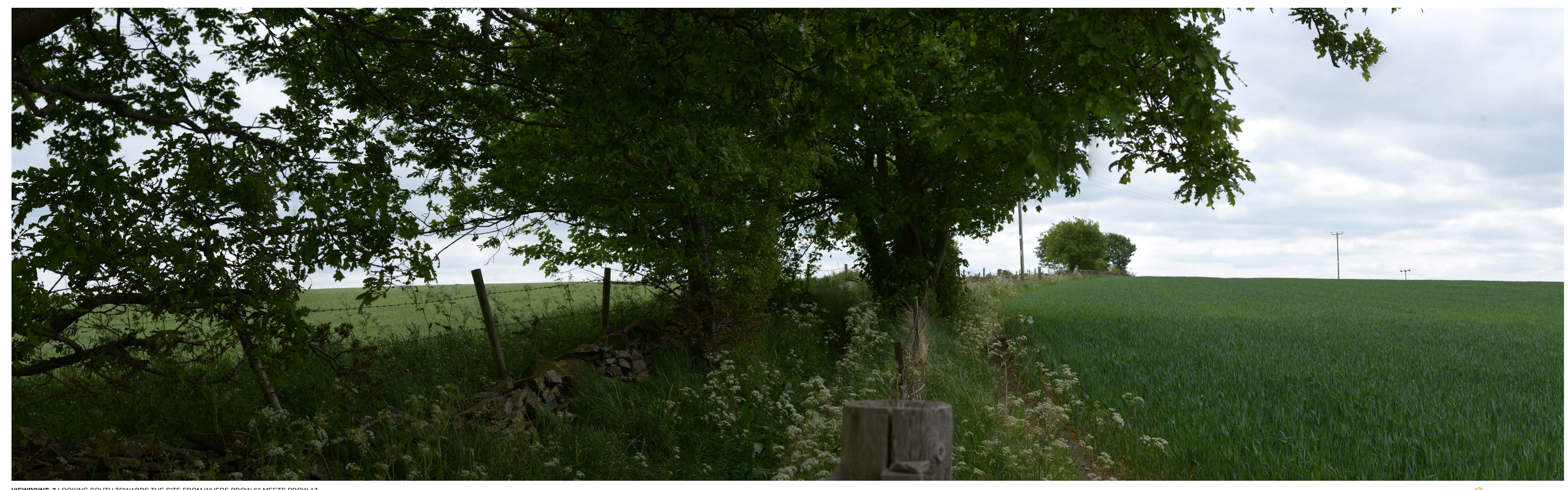
VIEWPOINT: 7 LOOKING SOUTH TOWARDS THE SITE FROM WHERE PROW 63 MEETS PROW 17.

DATE AND TIME OF PHOTOGRAPHY: 26/05/2020 AT 11:40 ENLARGEMENT FACTOR: 96% AT A1 MAKE AND MODEL OF CAMERA: NIKON D610 VIEW AT COMFORTABLE ARM'S LENGTH MAKE AND FOCAL LENGTH OF LENS: NIKON 50MM HORIZONTAL FIELD OF VIEW: 90° DIRECTION OF VIEW: SOUTH TO BE PRINTED AT A1 FOR ASSESSMENT PURPOSES