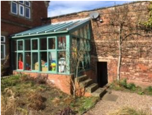
Inside the walled garden to the rear (small access door shown on submitted plans).