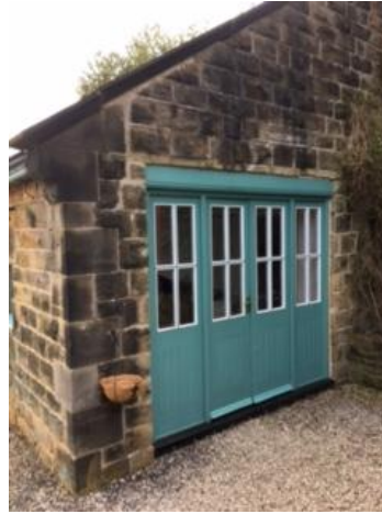
The outbuilding from as seen from The Avenue