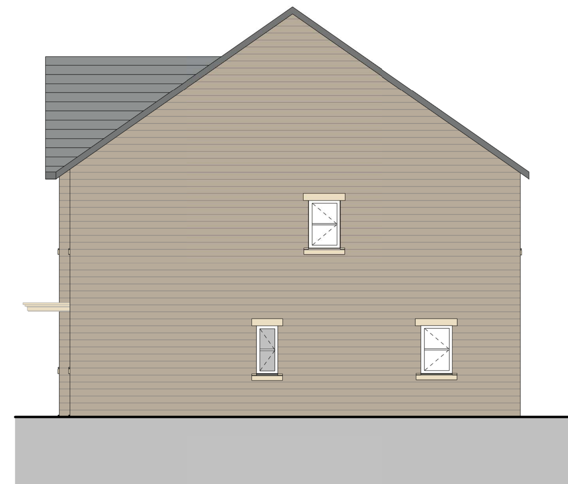
2 Side Elevation 01 1 : 50