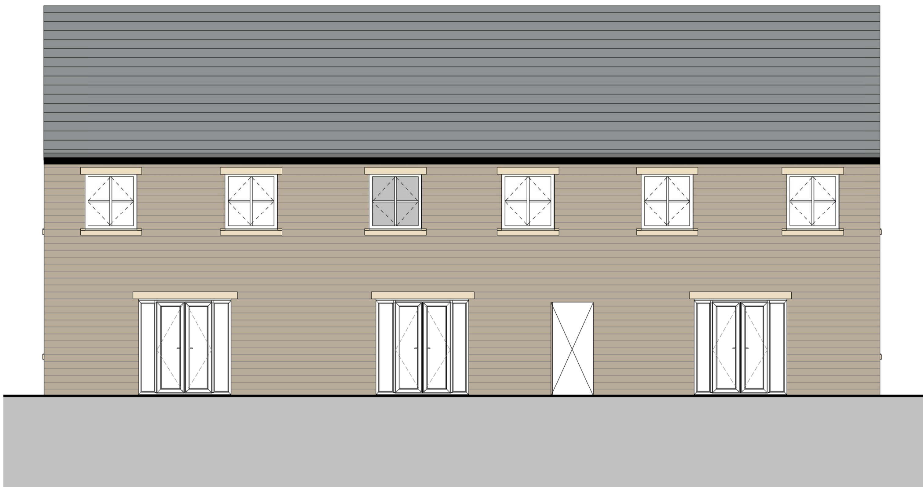
3 Rear Elevation 1 : 50