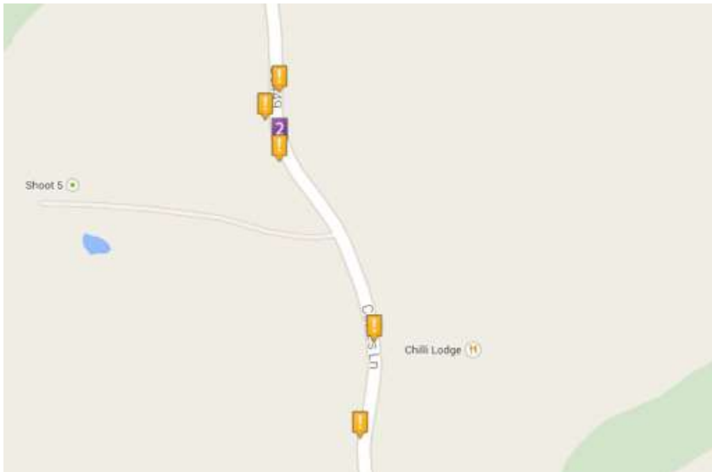
Crashmap plan showing road traffic accidents close to the site

27/01/2007 1 vehicle, 1 casualty, rated slight