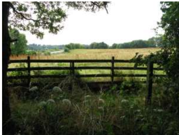
View across site from Trans Pennine Trail