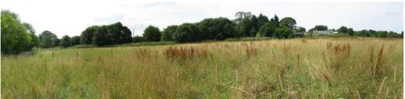
From within the site, the Listed Building is not visible