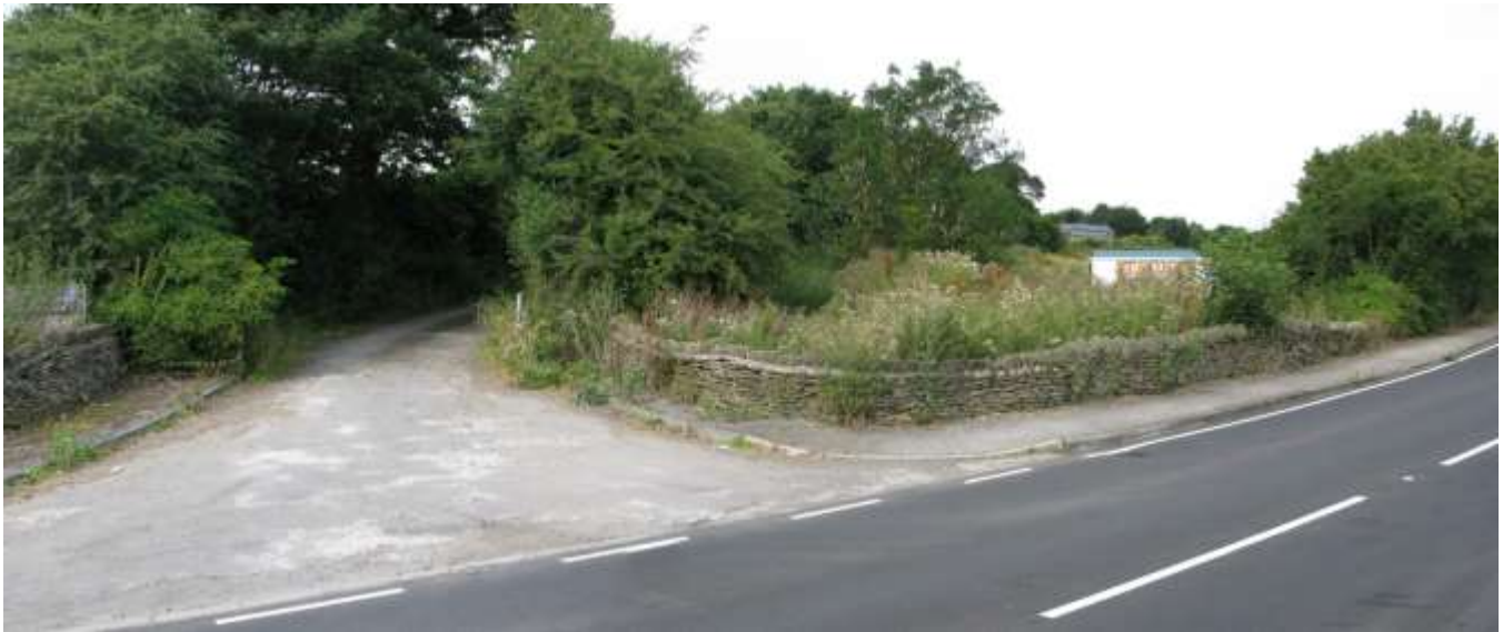
Existing access to Knabbs Hall Farm