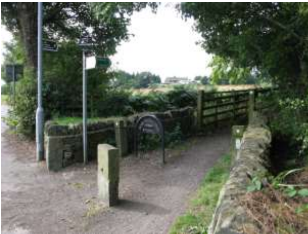
Access to the Trans Pennine Trail