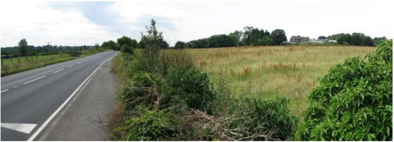
Visibility from the proposed site access is excellent, Knabbs Hall Farm can just be seen.