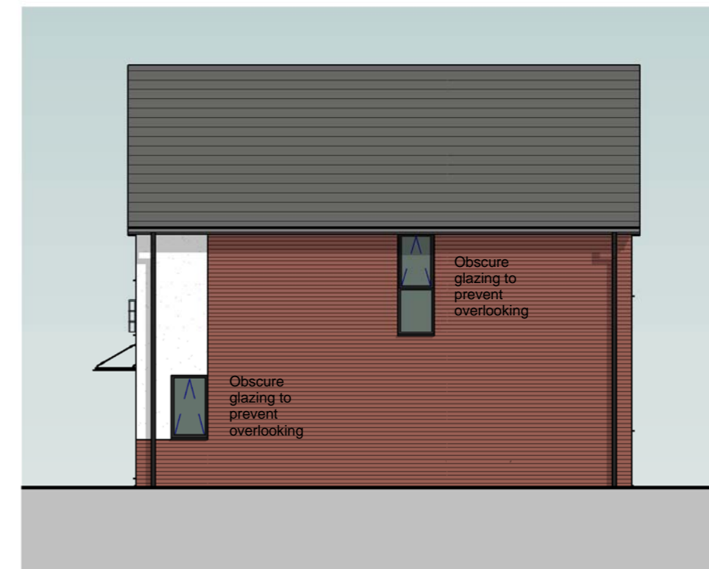
Plot 21 Side / South Elevation 1 : 100