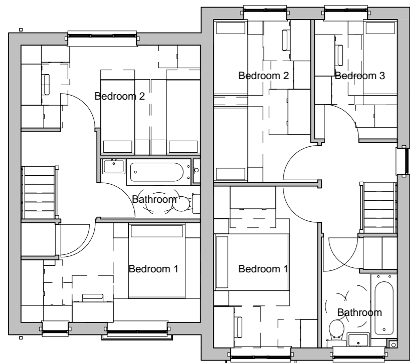
Plot 22 2B4P Plot 21 3B5P