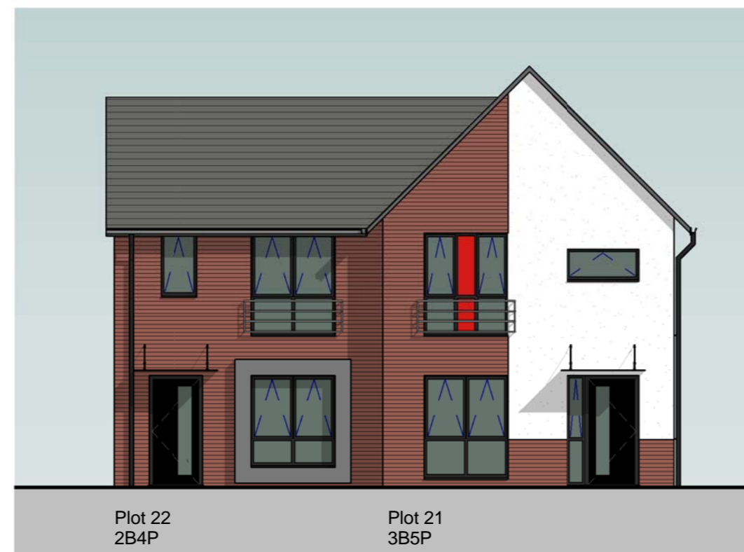
Plot 22 2B4P Plot 21 3B5P