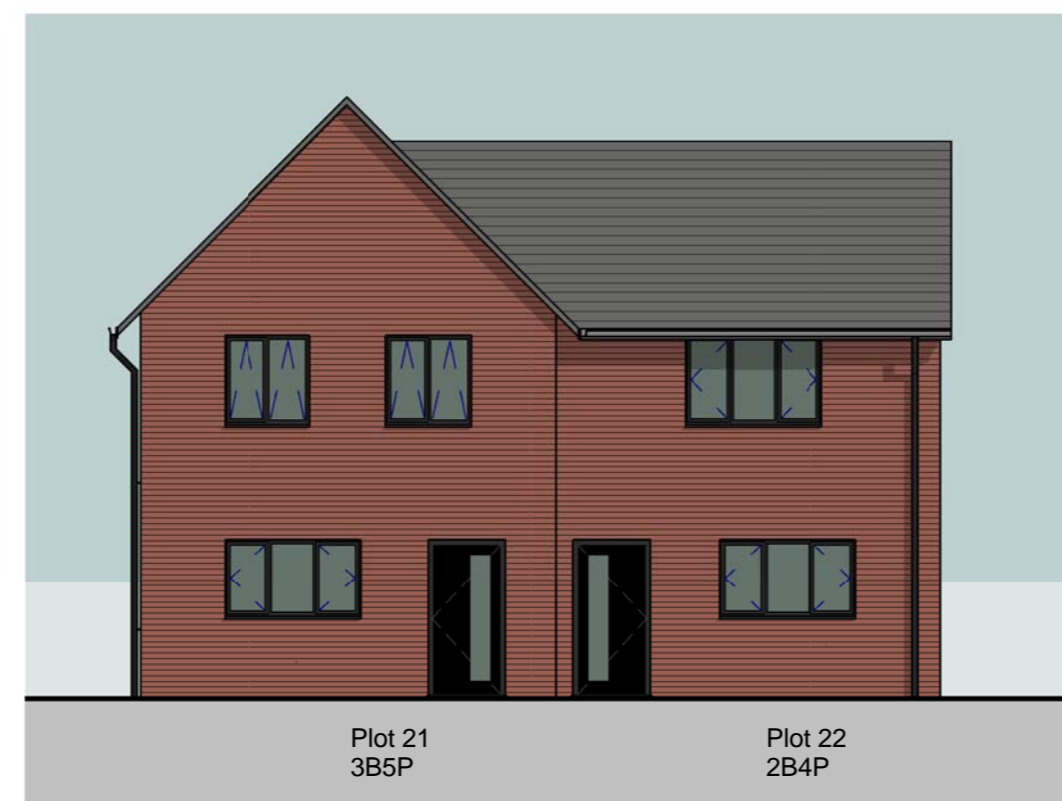
Plot 21 3B5P Plot 22 2B4P