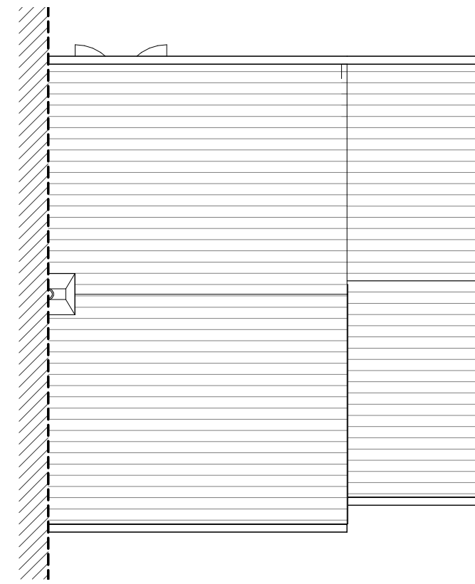
Existing Roof 1 : 100