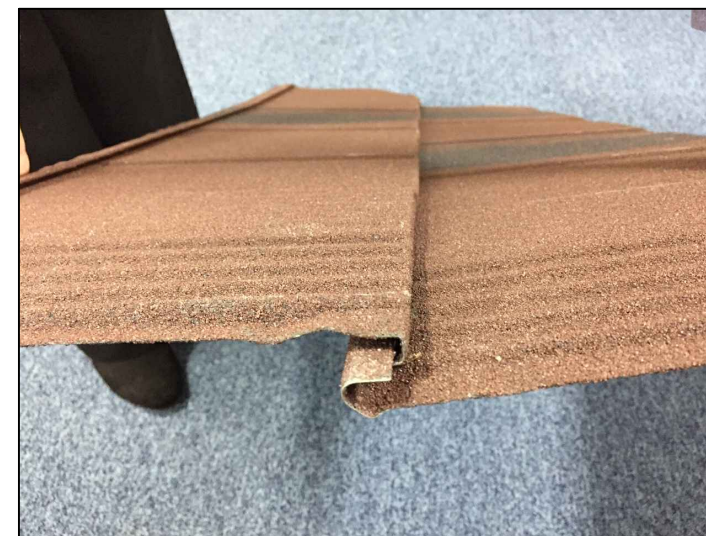
METRO TILE (CLADDING) SAMPLE

This drawing is the copyright of AXIS P.E.D Limited and may not be loaned, copied or reproduced in any way - or used for any offer, quote, tender or construction purposes without written consent of the company to do so