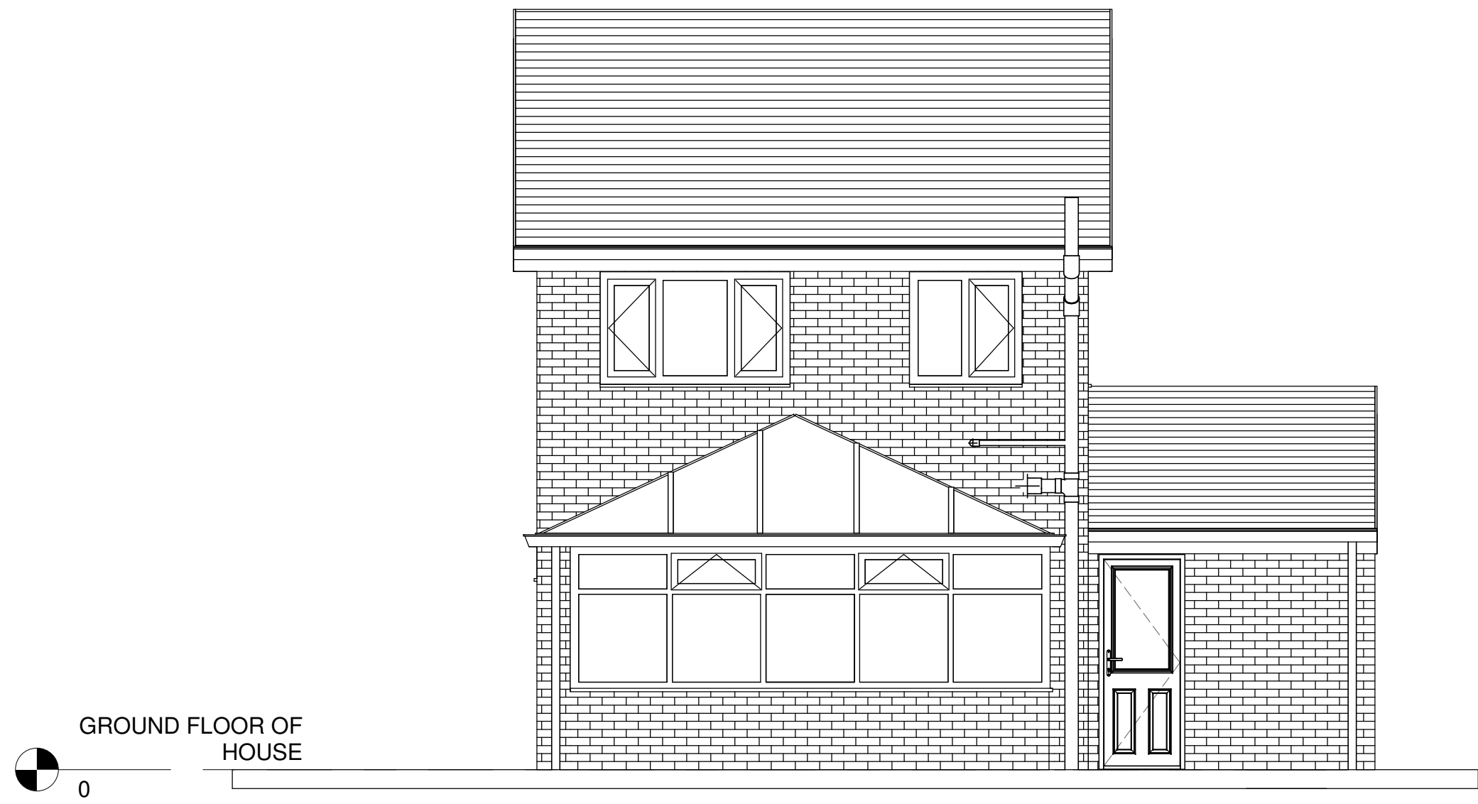
10 EXISTING REAR ELEVATION 1 : 50