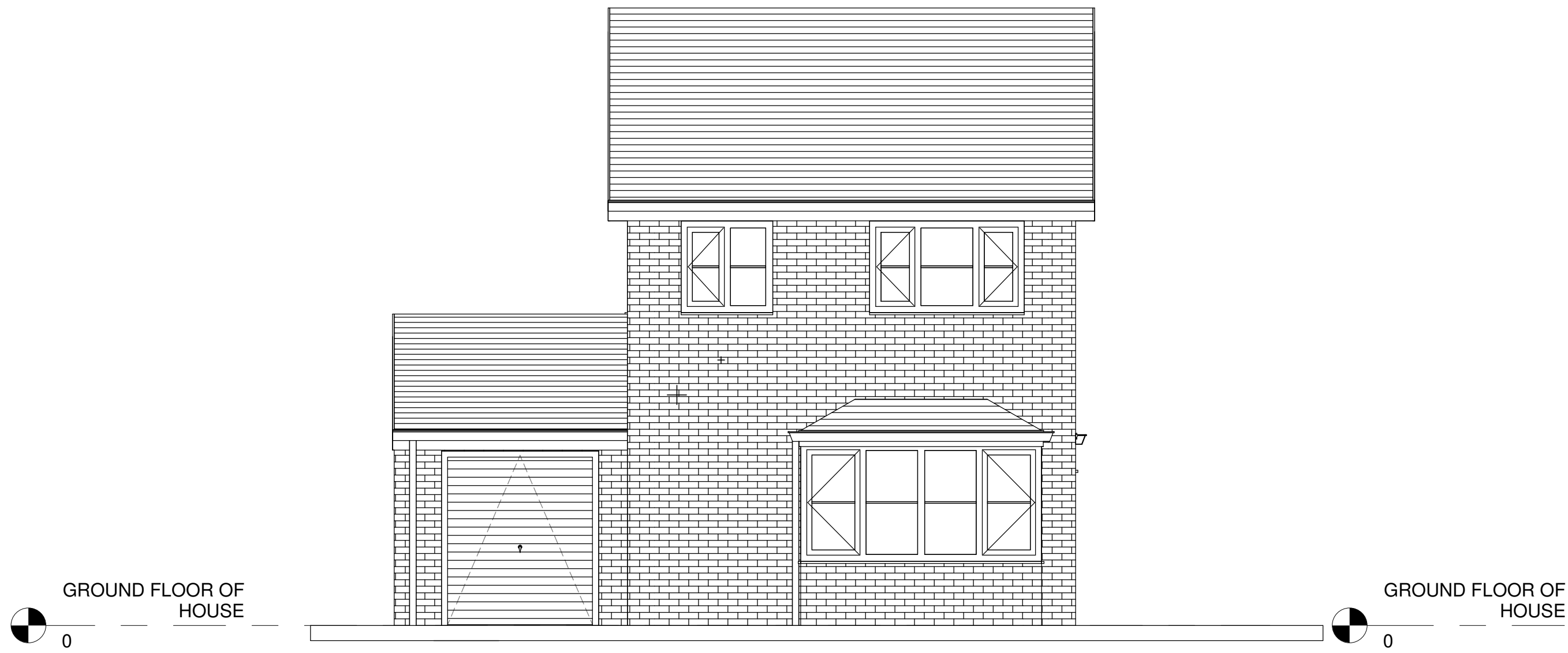
7 EXISTING FRONT ELEVATION 1 : 50