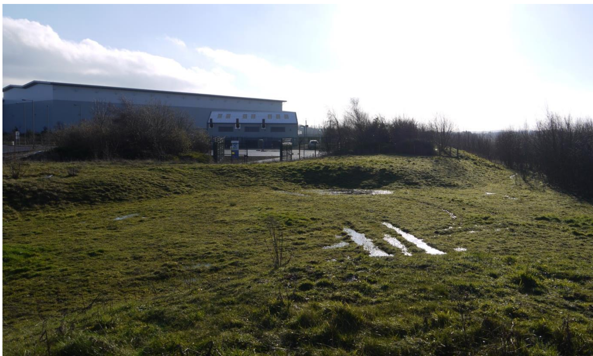
Photograph 2: View of the site and neighbouring electricity generating compound, towards the south.