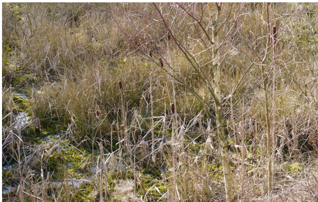
Photograph 4: View of the acid flush.