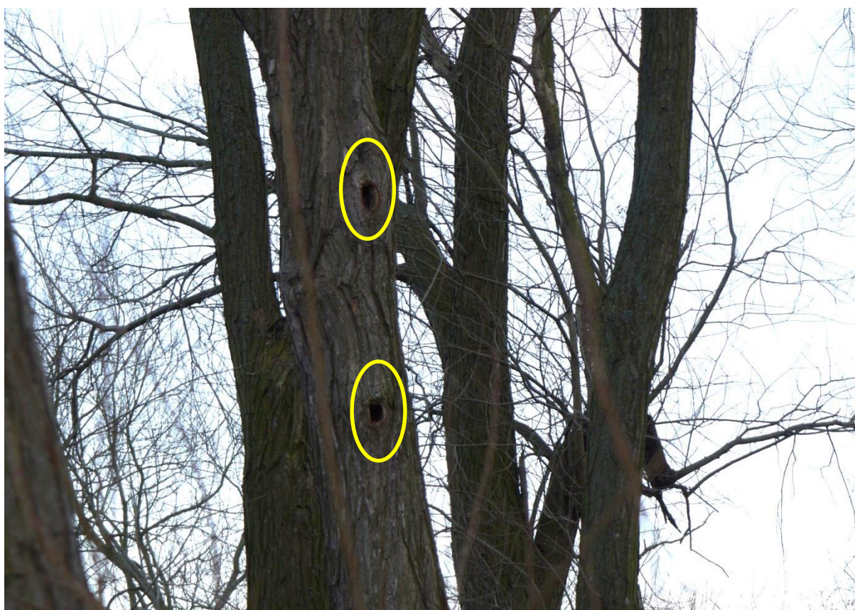
Photograph 4: View of mature woodland with woodpecker holes (highlighted).

There are 15 records of bat species within the 2km search buffer from the sites peripheries, 7 of the records are made up of pipistrelle species ( Pipistrellus spp. ) sightings, the most recent in 2005. There is also one record of a noctule bat ( Nyctalus noctula ) and a record of a Daubenton's bat ( Myotis daubentoni ) within the buffer area; both were noted over a decade ago. The remaining records are comprised of bat records which could not be identified to species level.