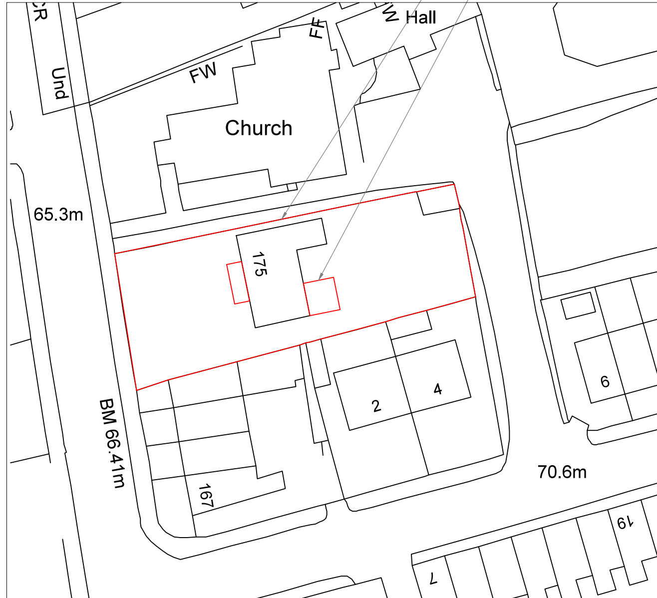
SITE PLAN SCALE 1:500 AT A3