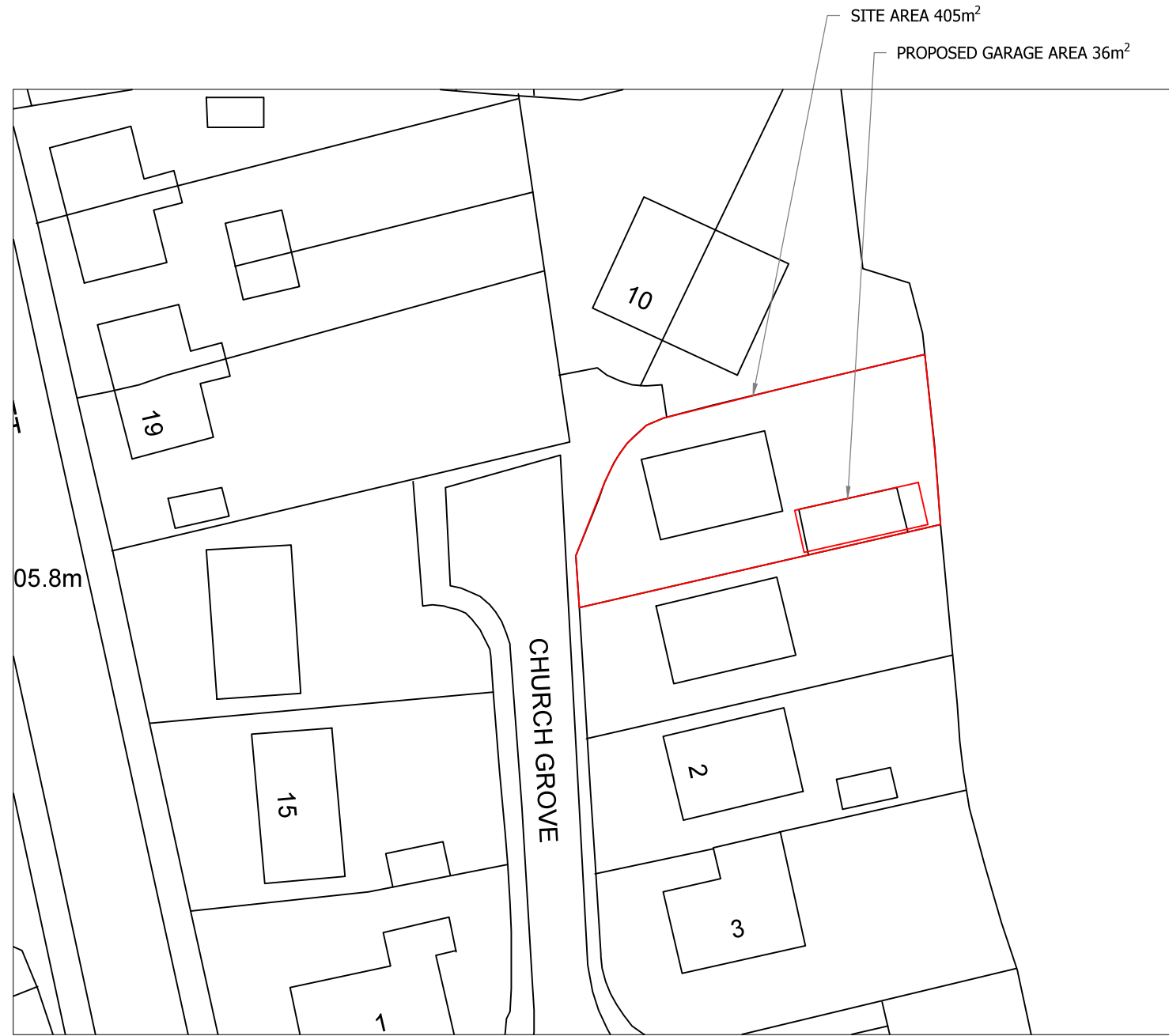
SITE PLAN SCALE 1:500 AT A3