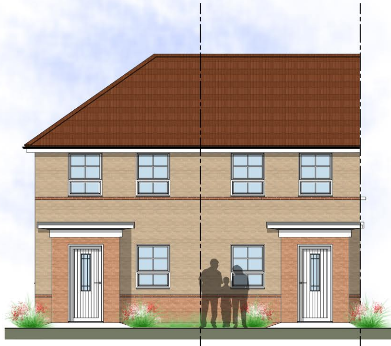
FRONT ELEVATION Denford - End Denford - Mid