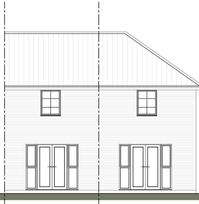
REAR ELEVATION Denford - Mid Denford - End