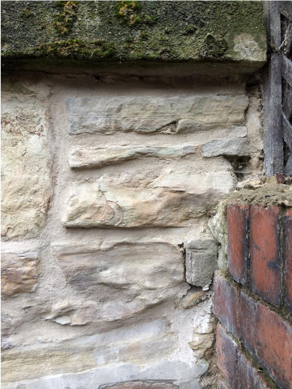
Sample area of proposed pointing using a mix of cement: lime (NHL 3.5): sand: mix of parts 1:2:9 with sand comprising 3 parts soft to 3 parts sharp grit sand.