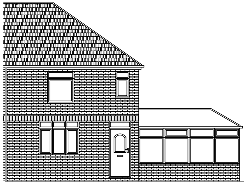
EXISTING FRONT ELEVATION SCALE 1:100 AT A3