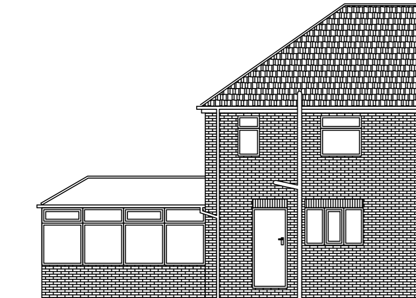
EXISTING REAR ELEVATION SCALE 1:100 AT A3