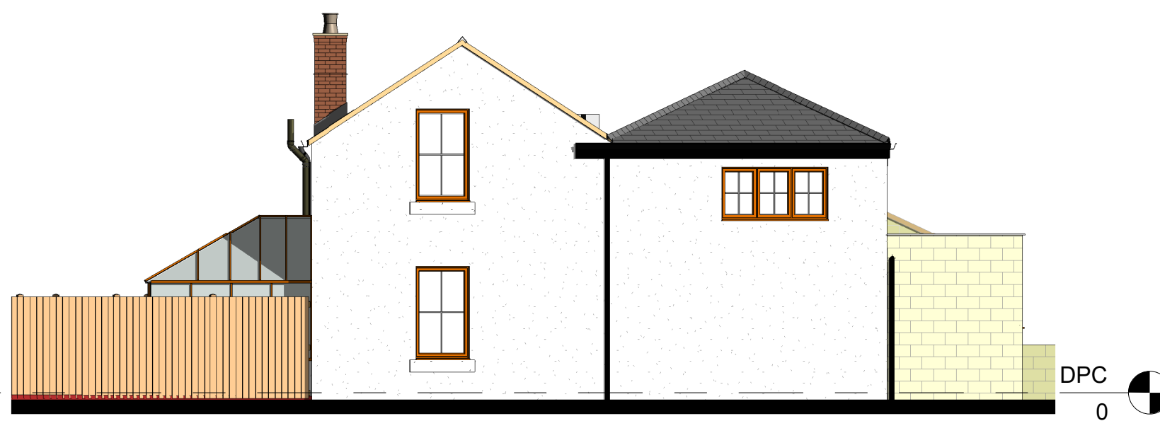
Right Side Elevation 1 : 100