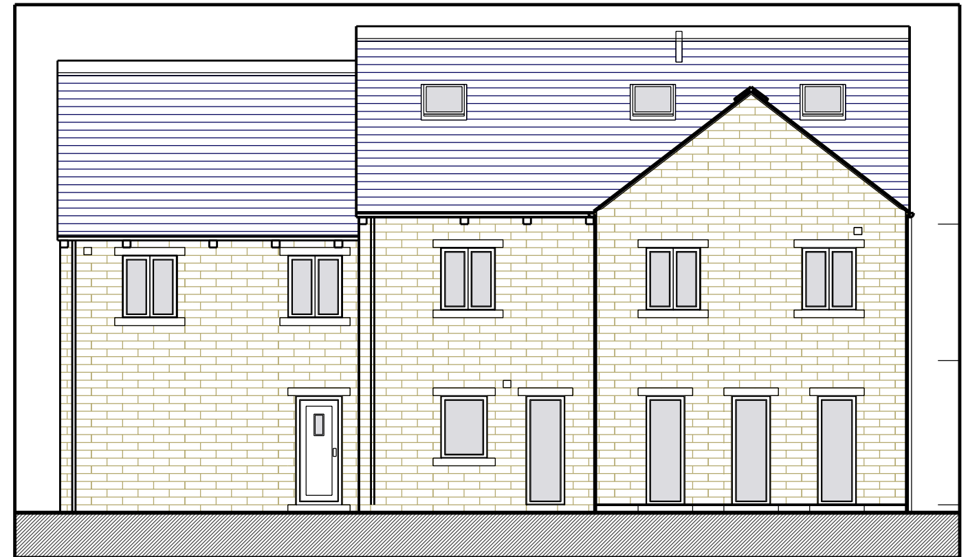
Dwelling 3 East Elevation - Proposed