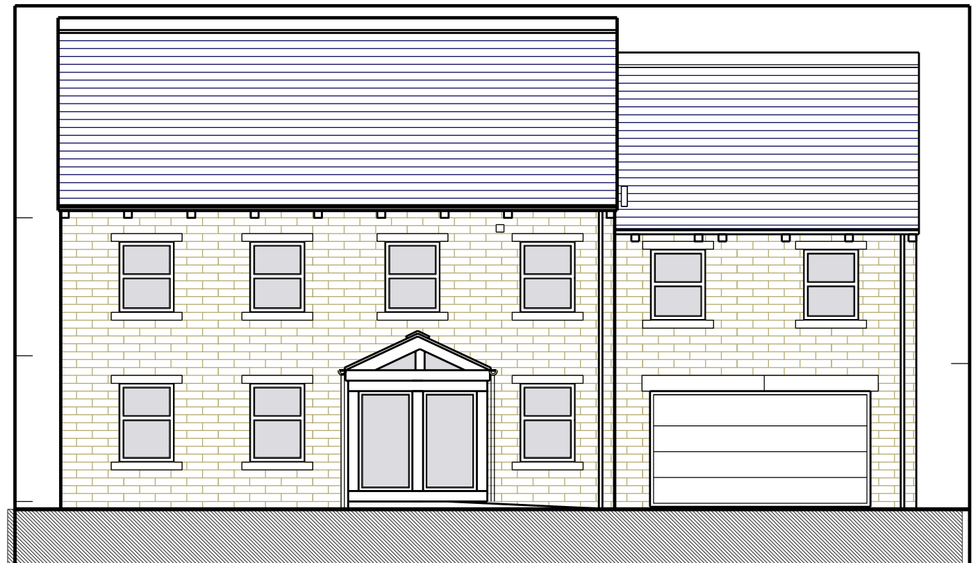
Dwelling 3 West Elevation - Proposed