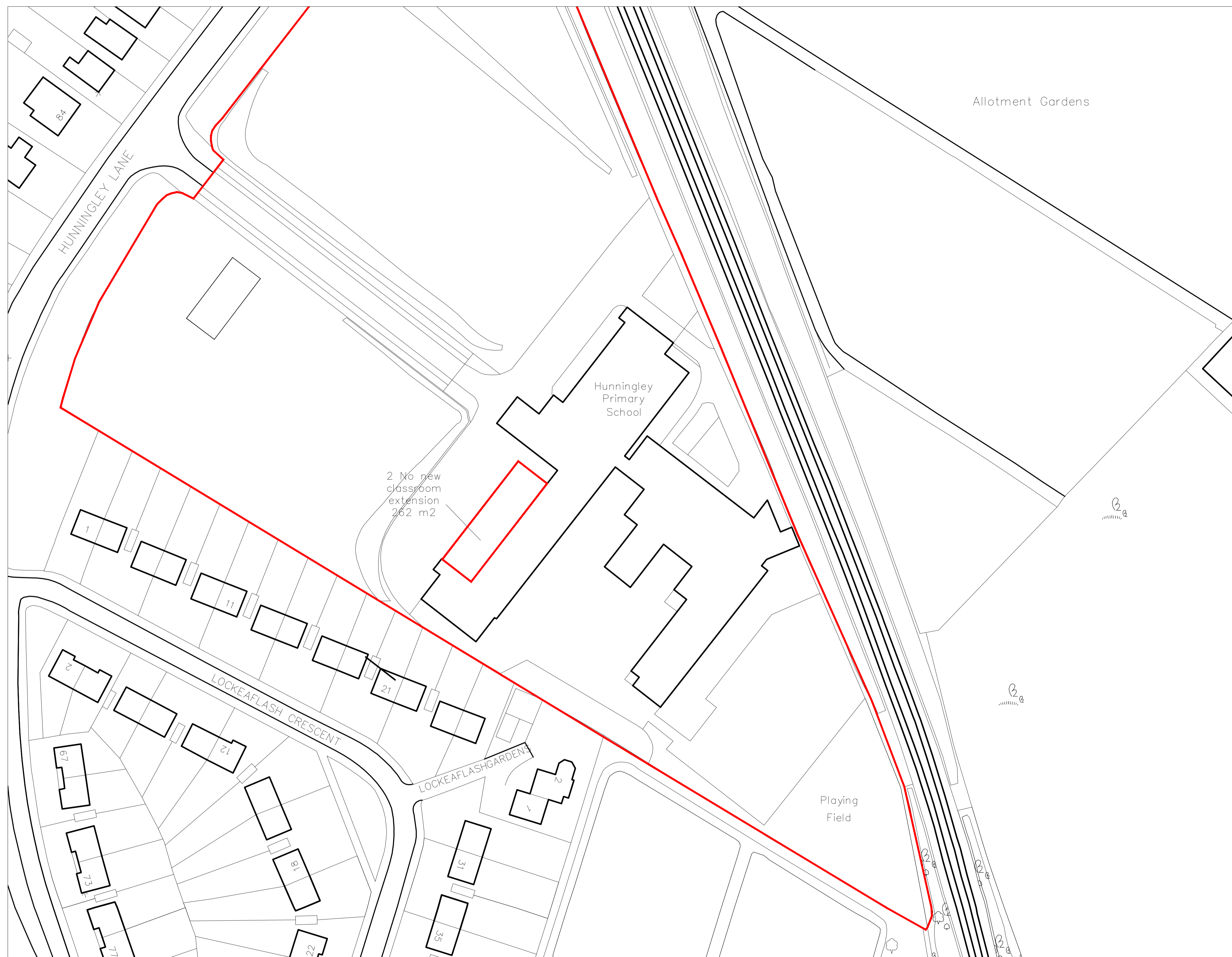
Block Plan @ 1:500