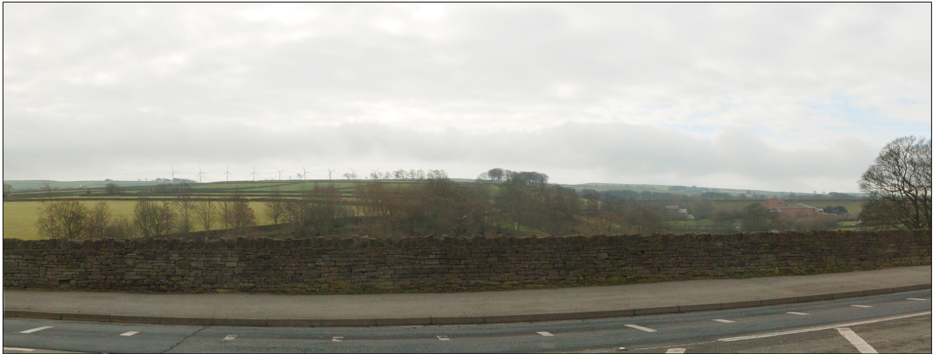
Existing view from viewpoint