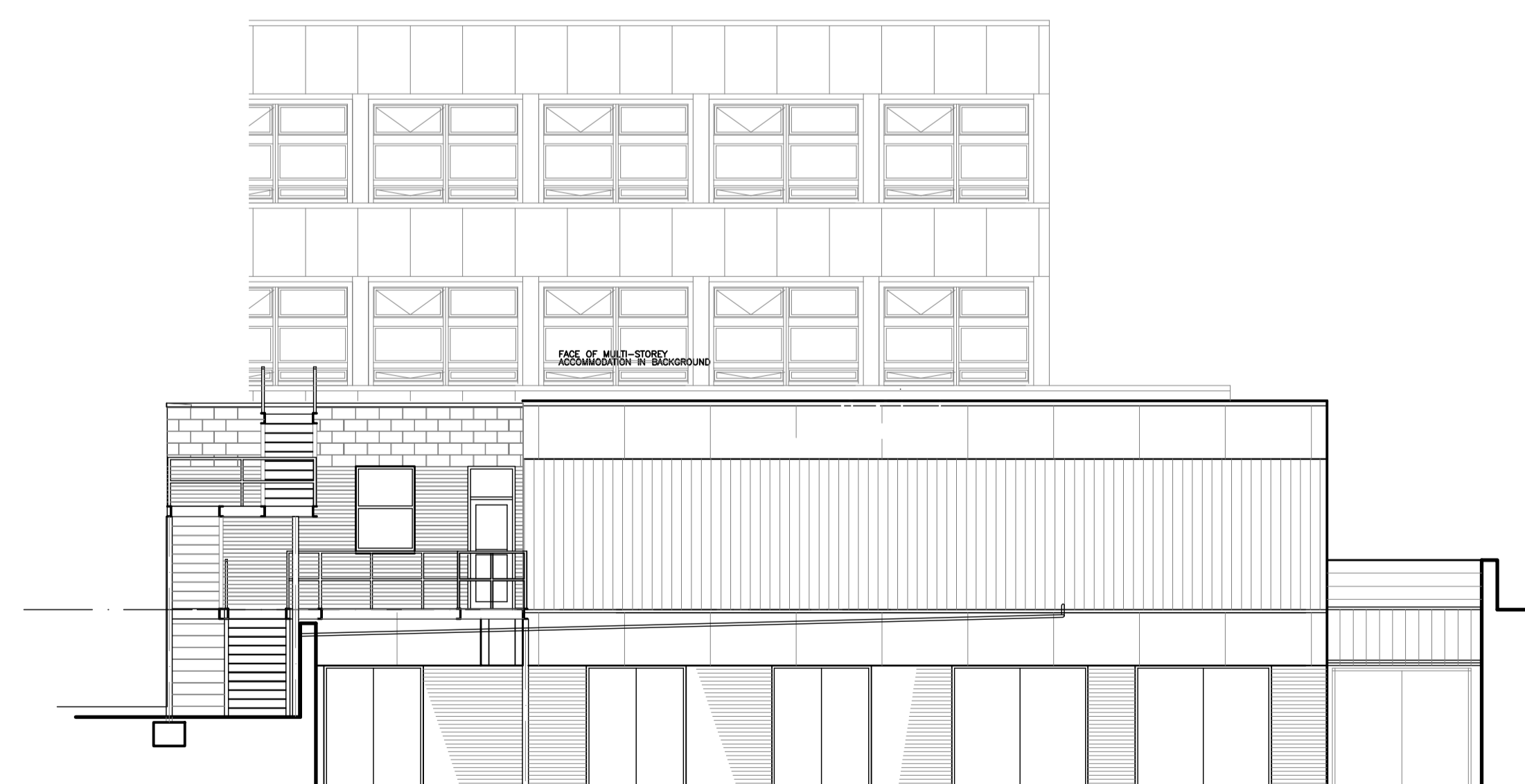
EXISTING EAST FACING ELEVATION 1:100