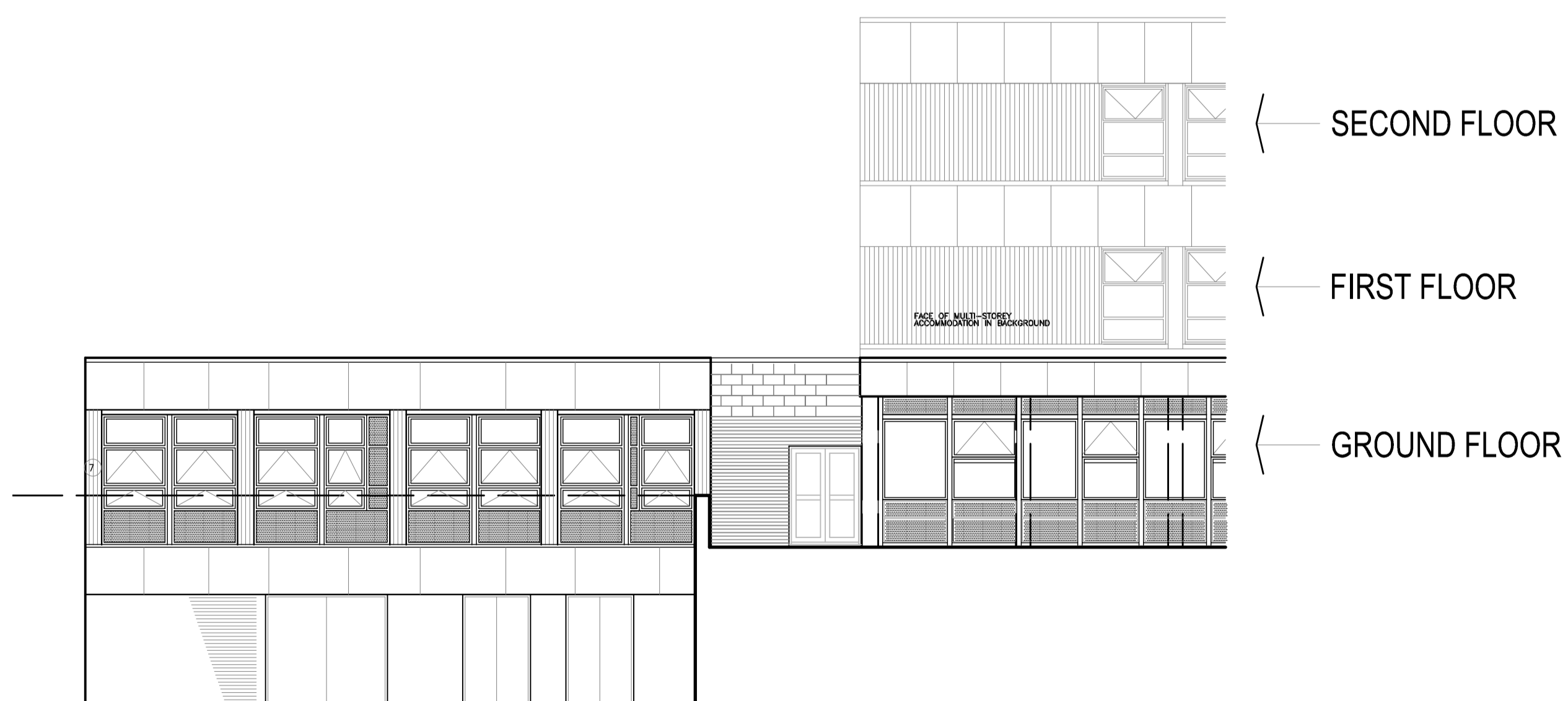
EXISTING NORTH FACING ELEVATION 1:100