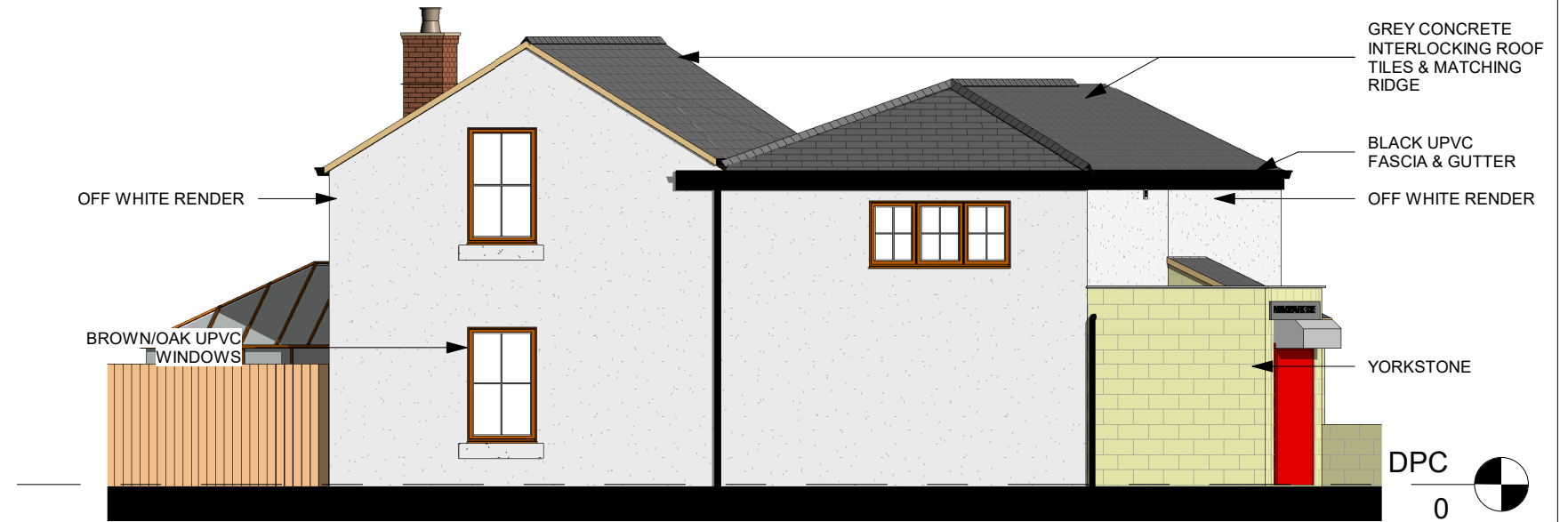
Right Side Elevation 1 : 100