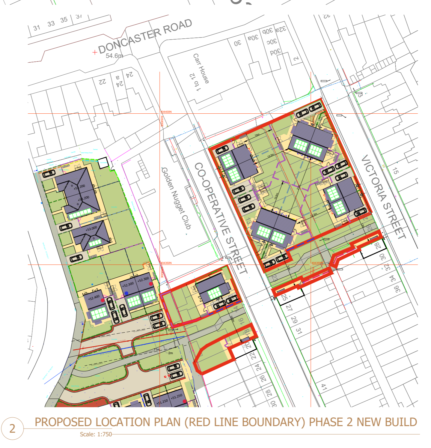
2 PROPOSED LOCATION PLAN (RED LINE BOUNDARY) PHASE 2 NEW BUILD Scale: 1:750