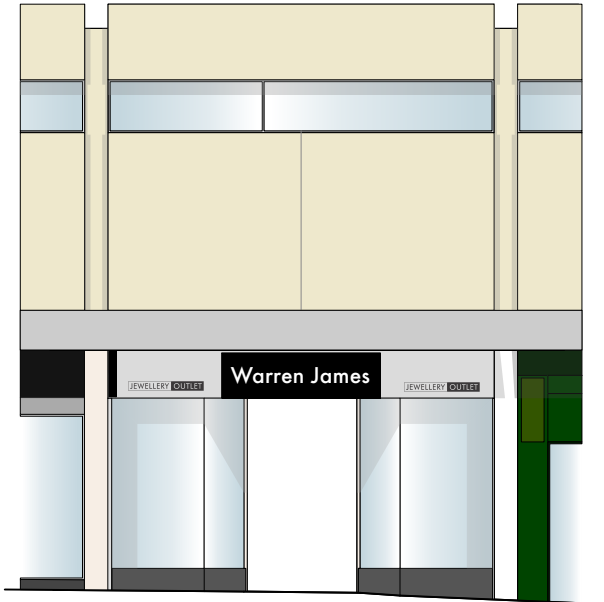
Existing Elevation Scale 1:100