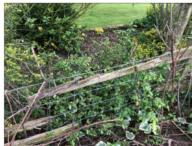
DETAILS AS EXISTING