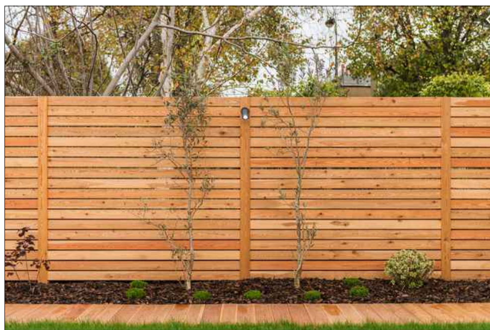
EXAMPLE OF THE REPLACED, 1.8M HIGH, TIMBER, HORIZONTAL, SLAT FENCE.