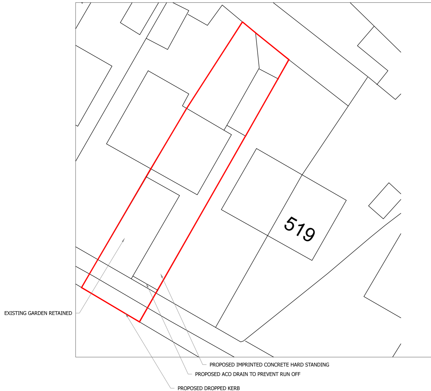
SITE PLAN SCALE 1:200 AT A3