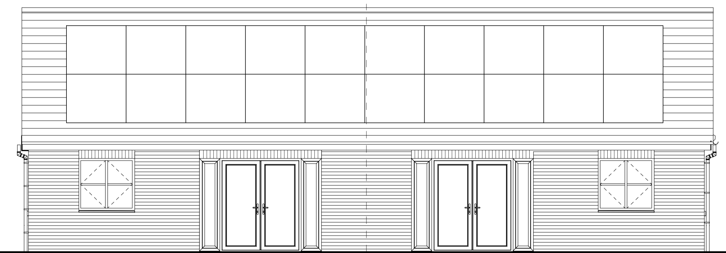
03 Rear Elevation 1:50