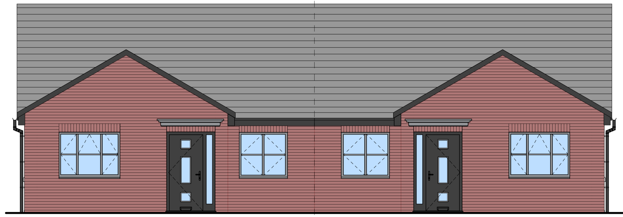
01 Front Elevation 1:50