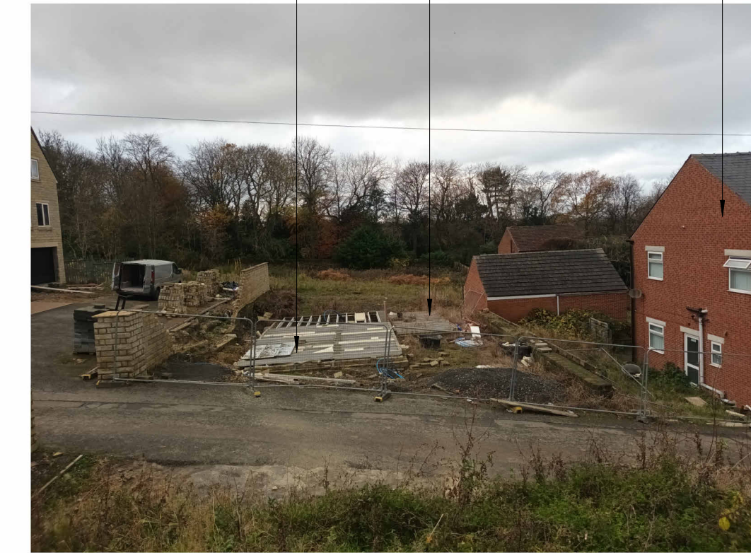
Garage set back from building line