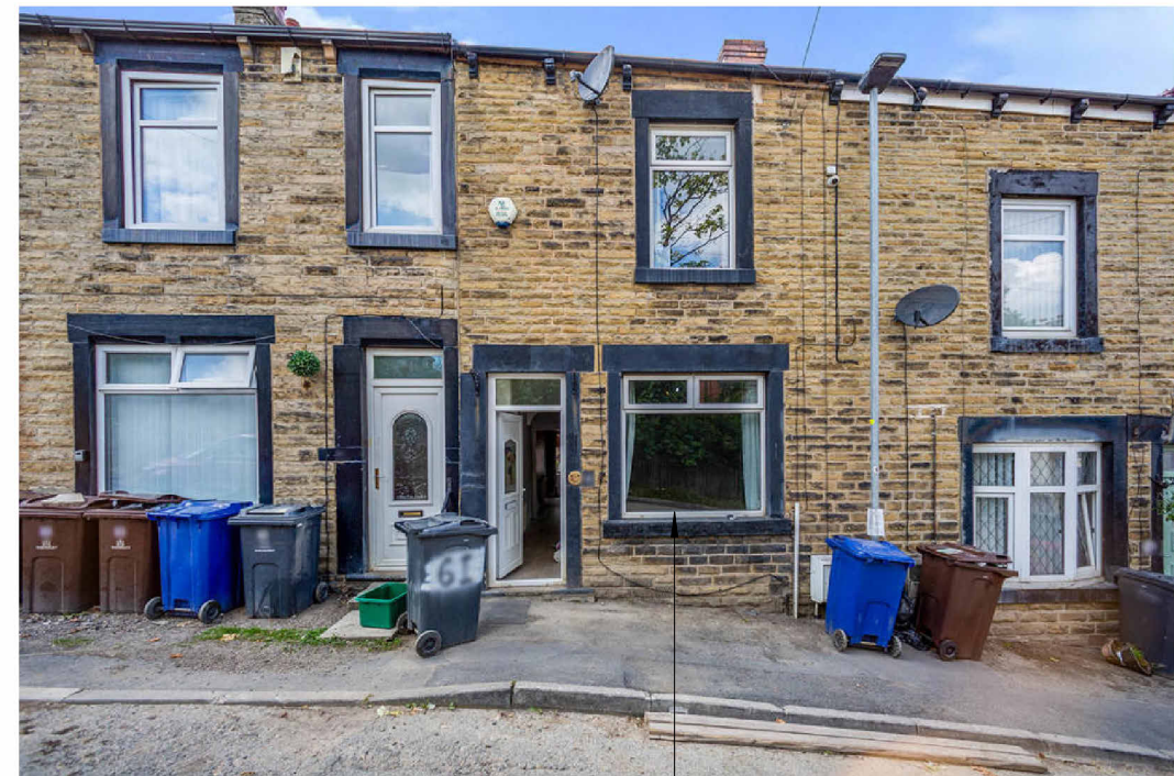
Stone window surrounds