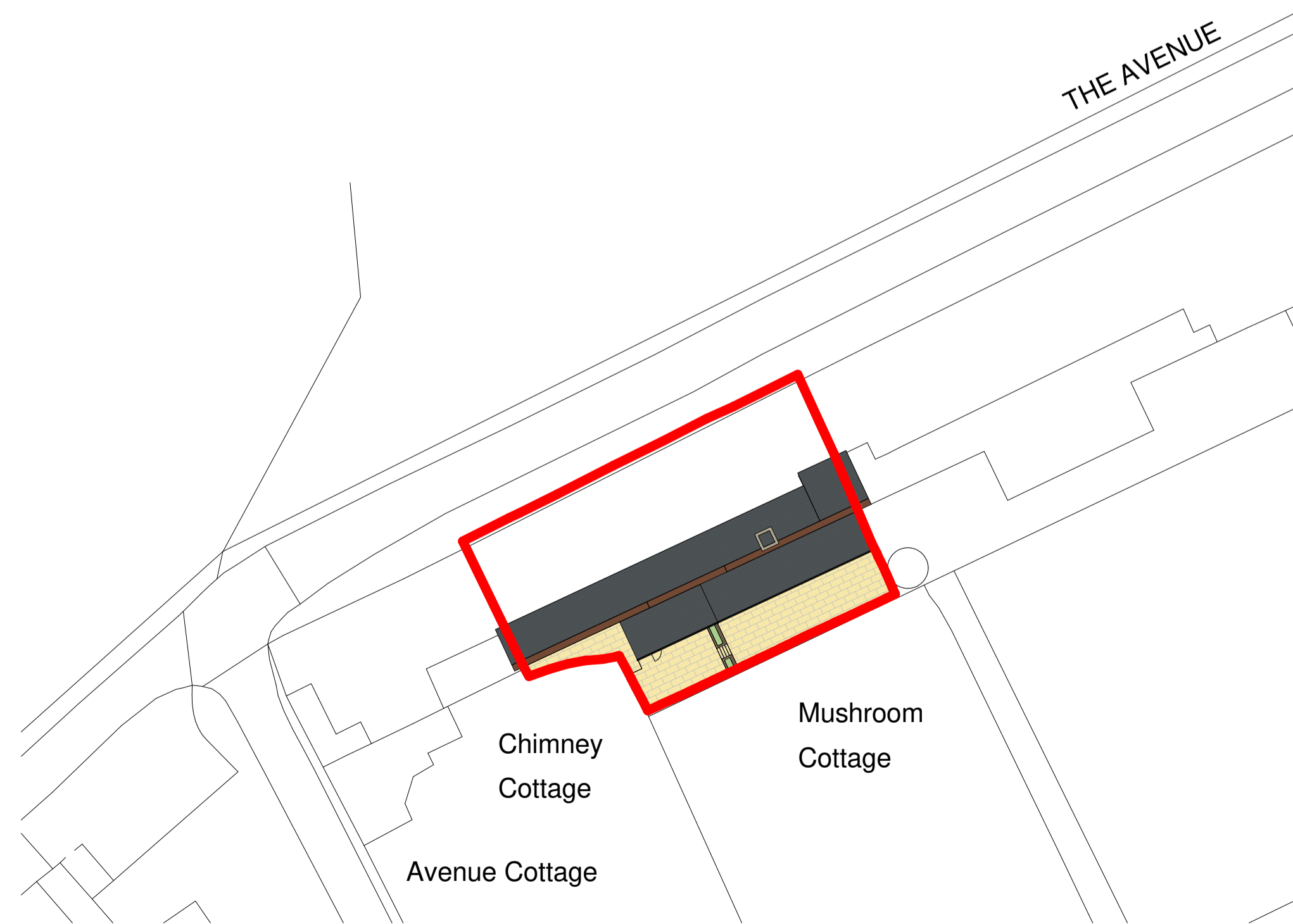
Block Plan Scale: 1 : 500

© The copyright in this drawing is vested in CodaStudios and no license or assignment of any kind has been, or is, granted to any third party whether by provision of copies or originals or otherwise unless agreed in writing.