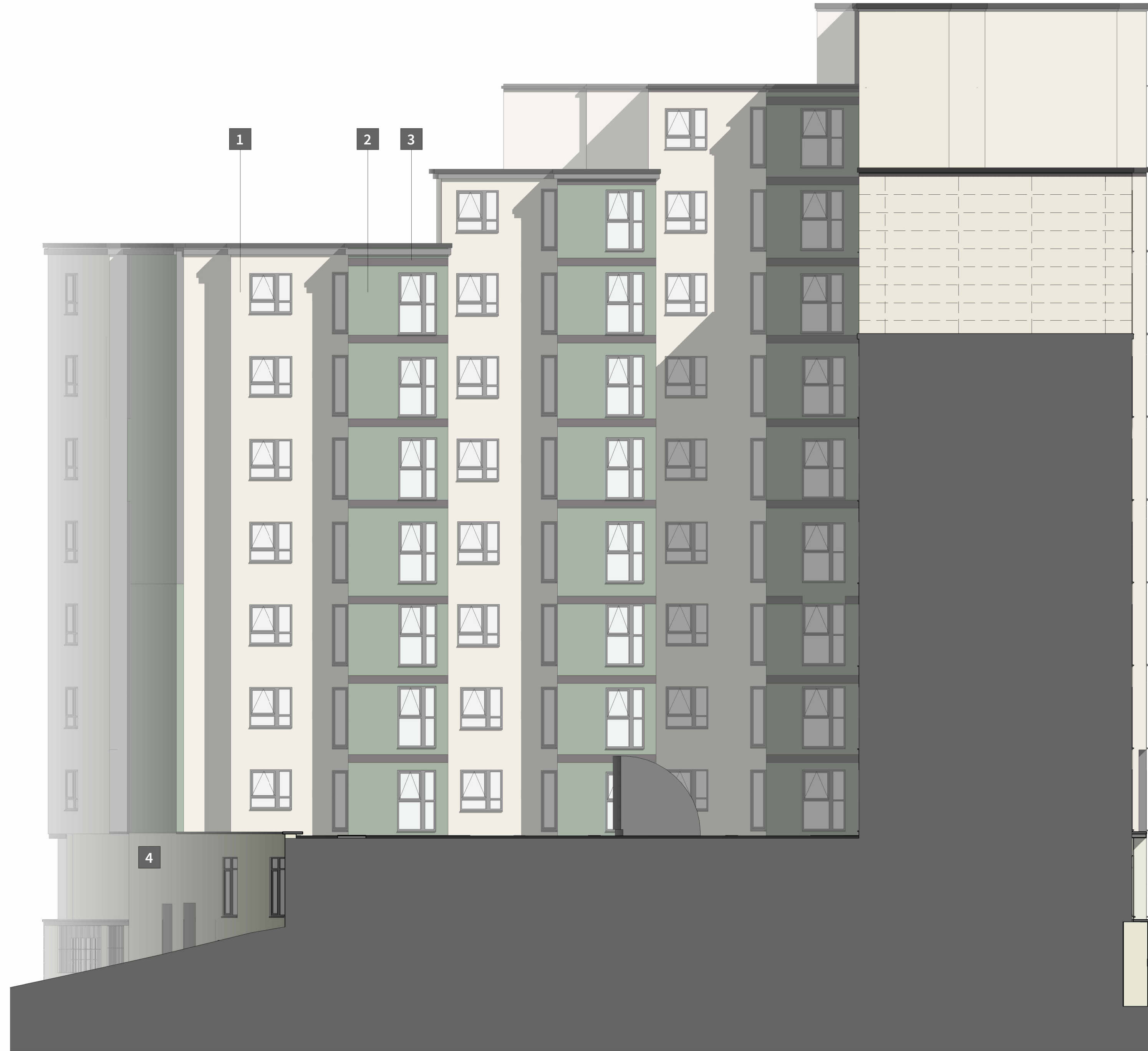
1 Existing_Elevation - Courtyard A 1:100