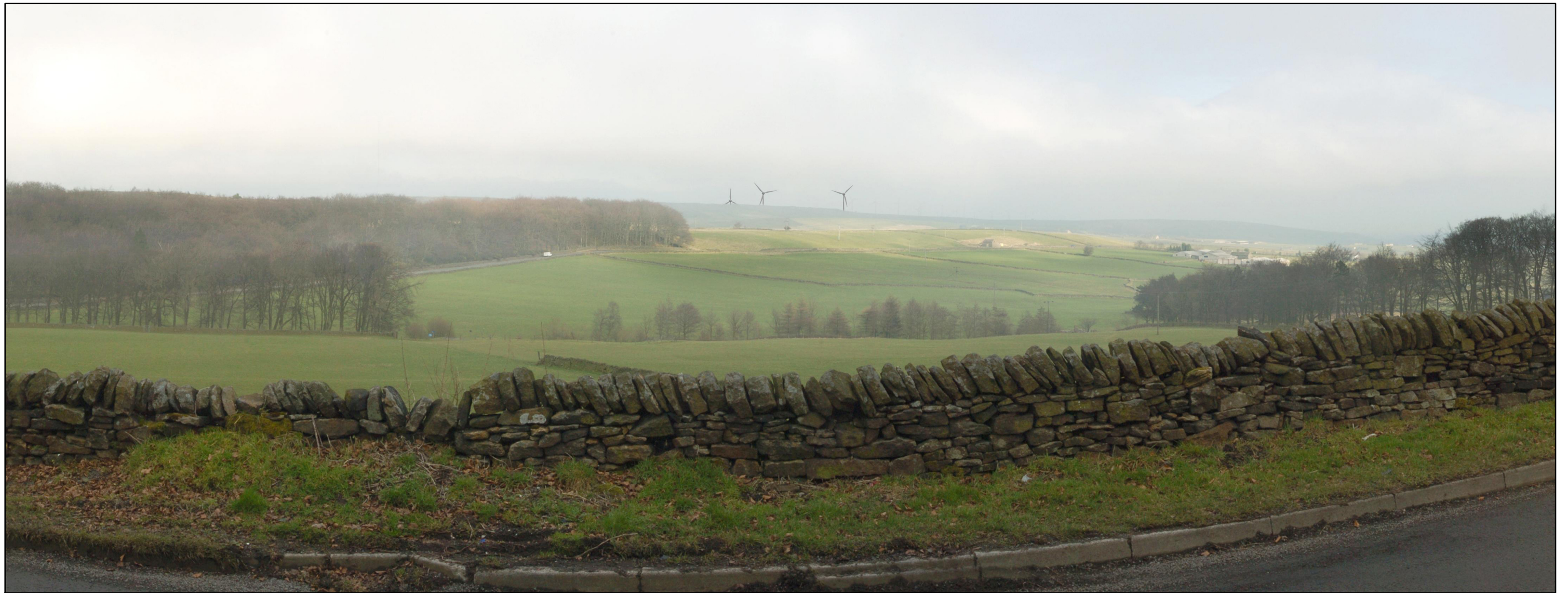
Photomontage showing proposed development from viewpoint