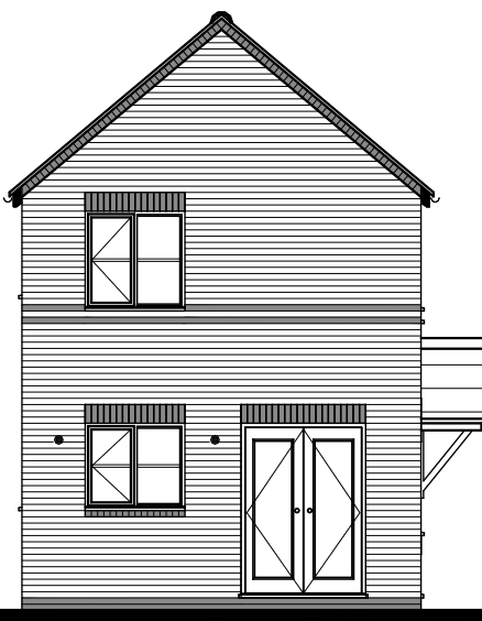
Elevation when detached/internal corner plot