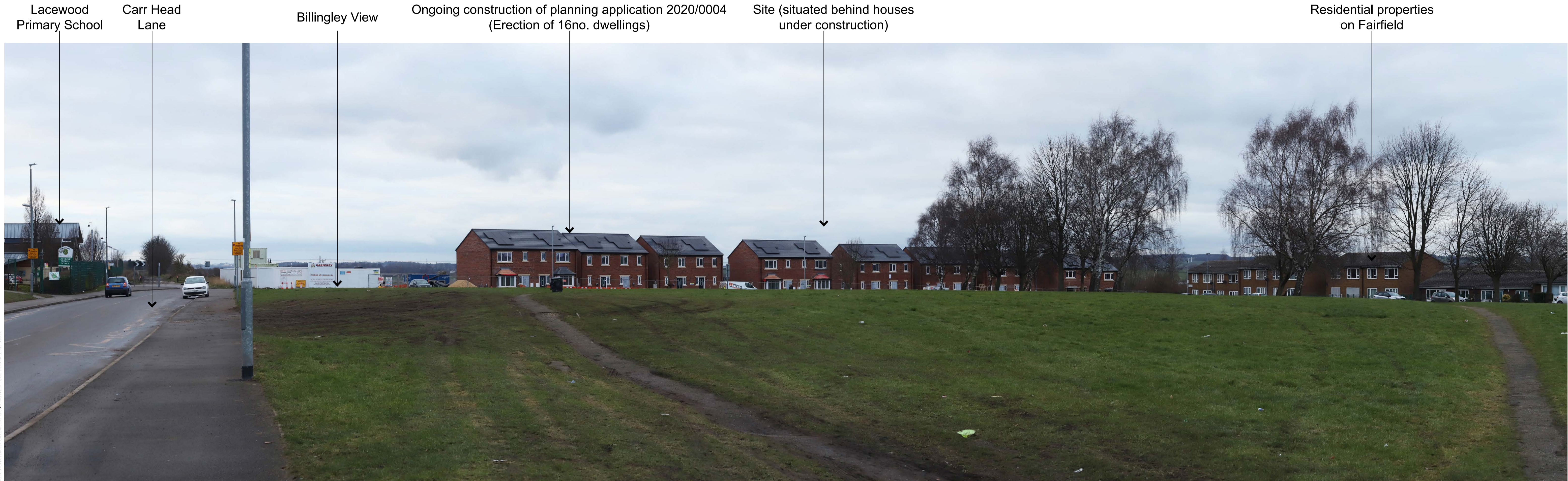
Photo Viewpoint 5: View north-west from Carr Head Lane, approximately 140m away from the site.