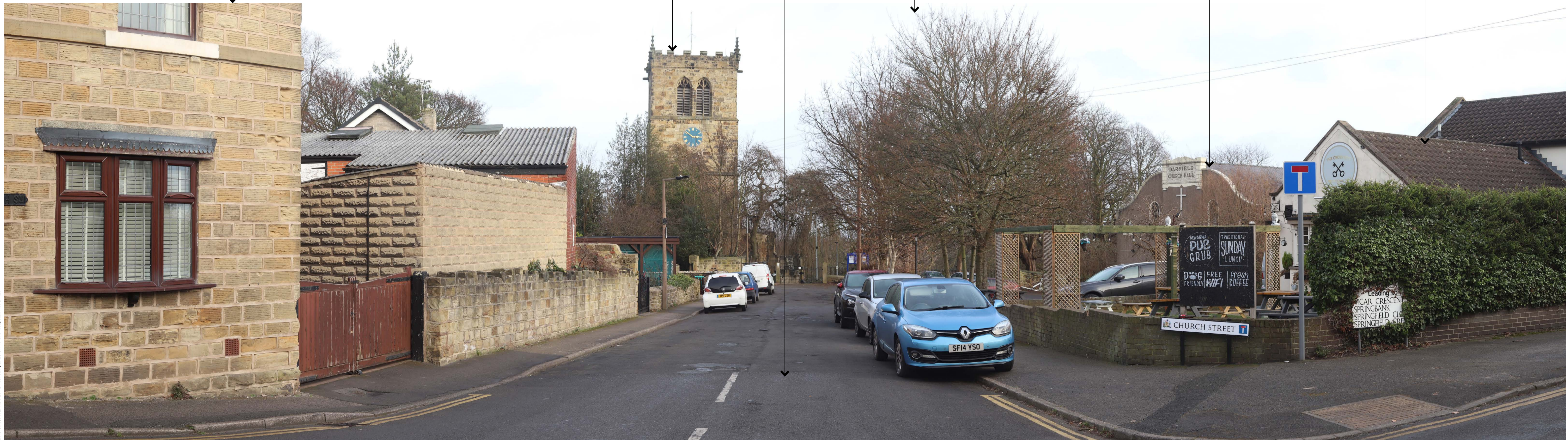
Photo Viewpoint 10: View east from junction of Vicar Road and Church Street, Darfield, approximately 2.2km away from the site.