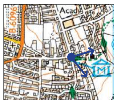
Photo Viewpoint 10 Date & time of photo: 1 February 2023, 15:01 Camera make & model, & sensor format: Canon EOS 6D, FFS Horizontal Field of View: 87° Direction of View: 100°, bearing from North

Photo Viewpoint 9 Date & time of photo: 1 February 2023, 14:26 Camera make & model, & sensor format: Canon EOS 6D, FFS Horizontal Field of View: 87° Direction of View: 110°, bearing from North