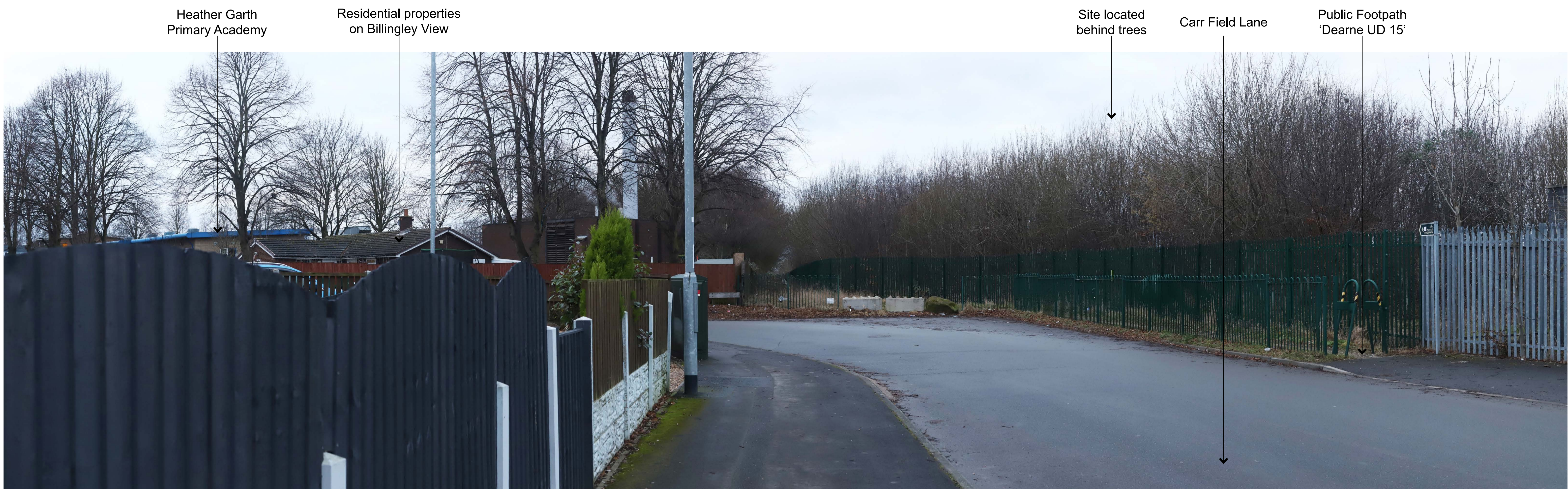
Photo Viewpoint 4: View west from the junction of Billingley View and Carr Field Lane, approximately 170m away from the site.