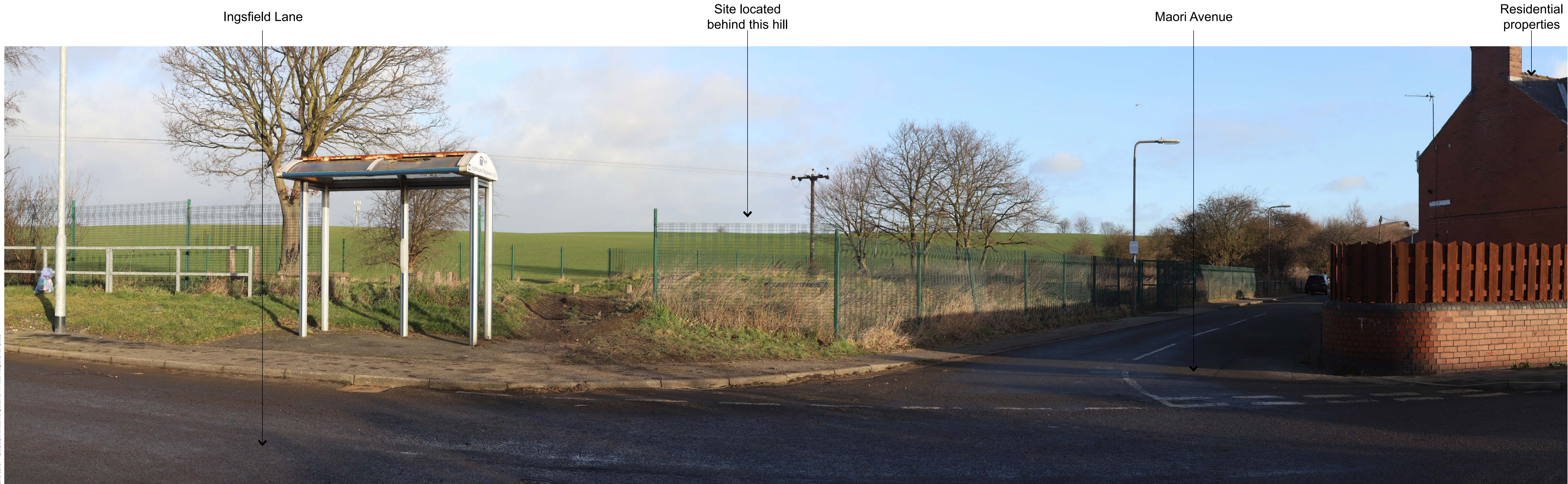
Photo Viewpoint 8: View north from Ingsfield Lane and Broadwater, approximately 415m away from the site.