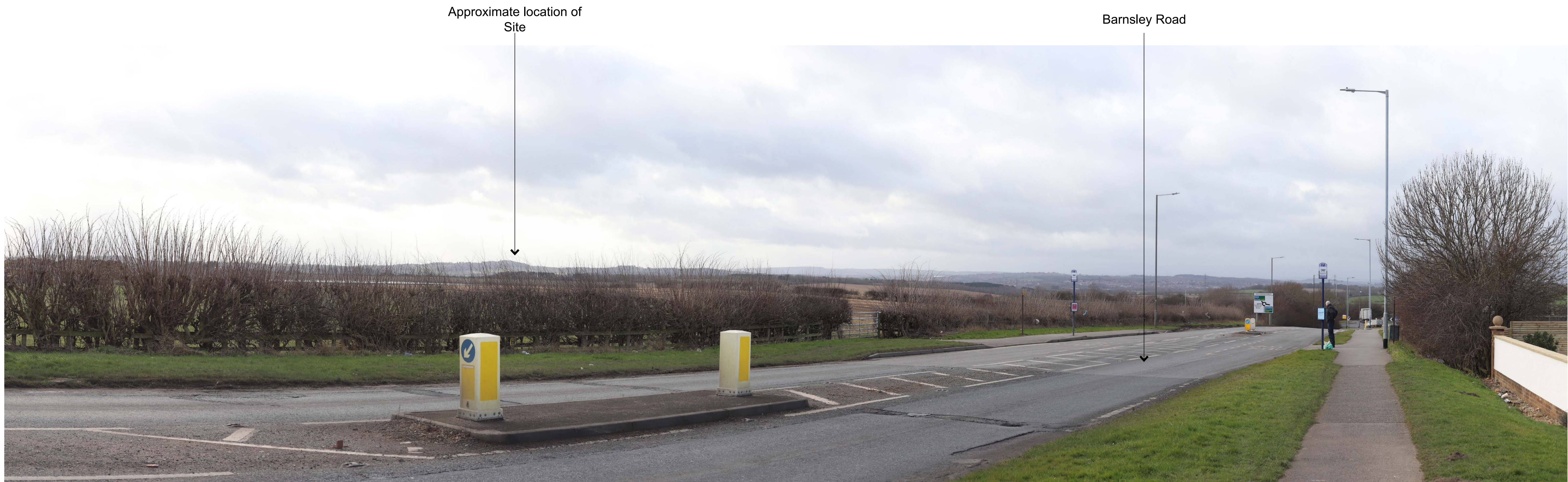
Photo Viewpoint 7: View south-west from junction of Barnsley Road and Holly Grove, approximately 350m away from the site.