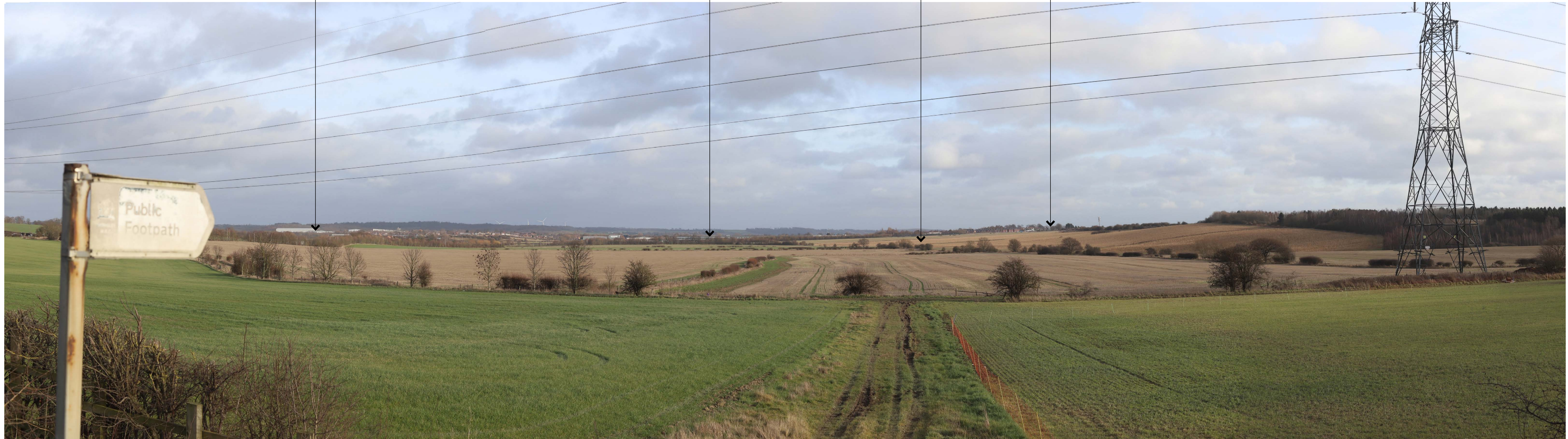
Photo Viewpoint 9: View east from Public Footpath 'Billingley CP 6', approximately 1.1km away from the site.