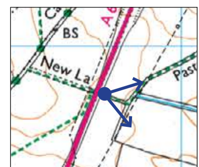
Photo Viewpoint 9 Date & time of photo: 1 February 2023, 14:26 Camera make & model, & sensor format: Canon EOS 6D, FFS Horizontal Field of View: 87° Direction of View: 110°, bearing from North