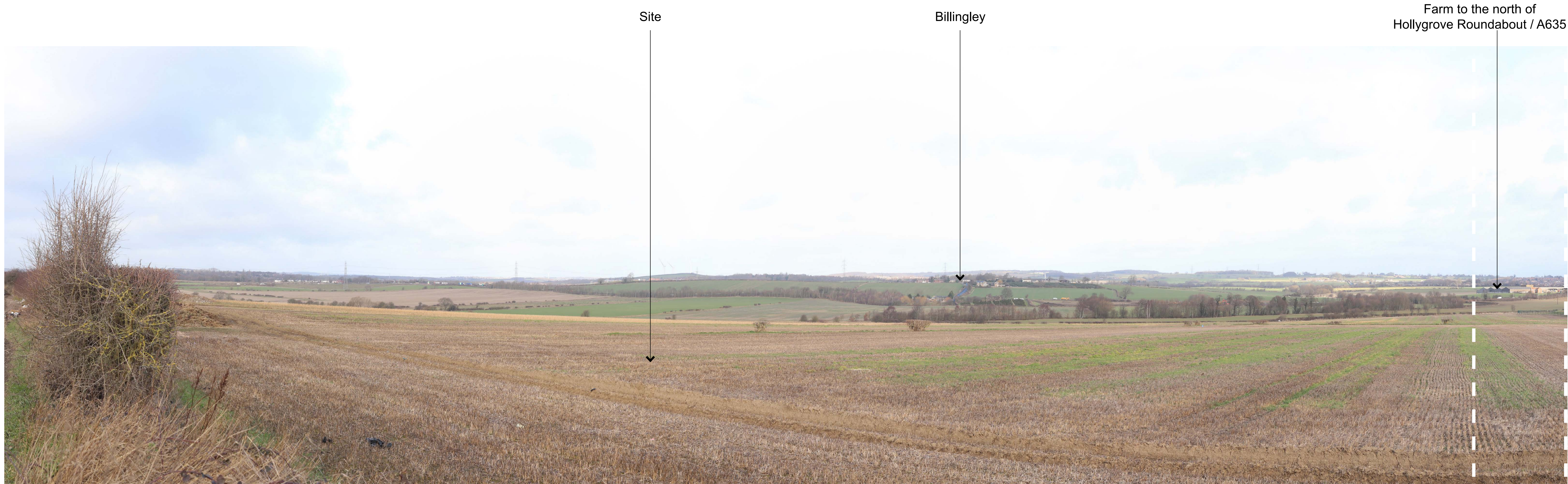
Photo Viewpoint 6: View north-east from Carr Head Lane, adjacent to the southern boundary of the site.