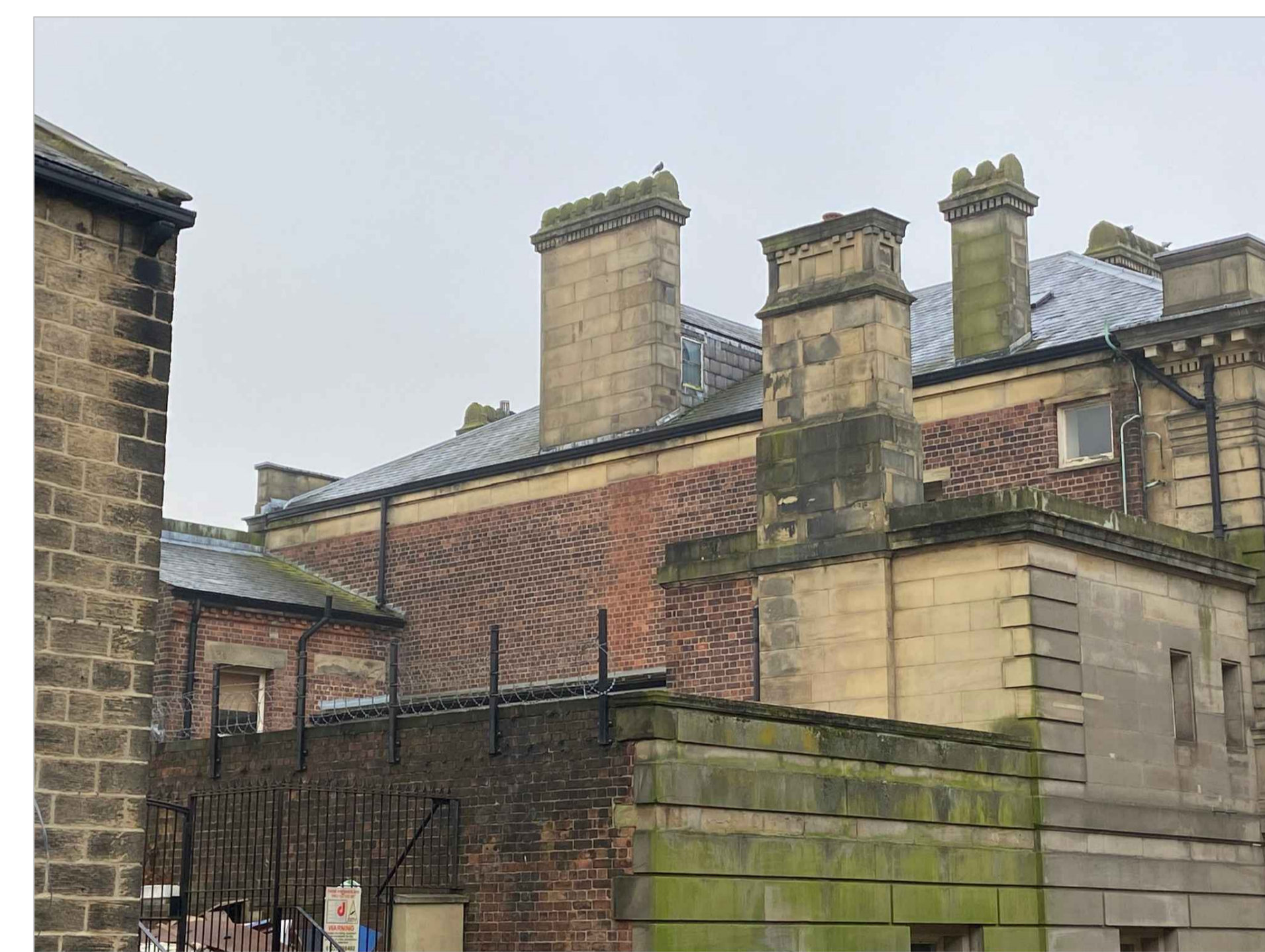
04 Photo from Eastgate

RESPONSIBILITY IS NOT ACCEPTED FOR OTHERS SCALING DIRECTLY FROM THIS DRAWING. DO NOT SCALE FROM THIS DRAWING, USE WRITTEN DIMENSIONS ONLY. 0m 0.5 1.0 1.5 3.0m 1:50 ORIGINAL SHEET SIZE A1 THIS DRAWING IS PRODUCED FOR USE IN THIS PROJECT ONLY AND MAY NOT BE USED FOR ANY OTHER PURPOSE. THE ORIGINATOR ACCEPTS NO LIABILITY FOR THE USE OF THIS DRAWING OTHER THAN THE PURPOSE FOR WHICH IT WAS INTENDED IN CONNECTION WITH THIS PROJECT AS RECORDED IN THE 'PURPOSE FOR ISSUE' AND 'FILE STATUS CODE'. THIS DRAWING MAY NOT BE REPRODUCED IN ANY FORM WITHOUT PRIOR WRITTEN AGREEMENT. © CROWN COPYRIGHT AND DATABASE RIGHTS — ORDNANCE SURVEY LICENCE NUMBER 100022264