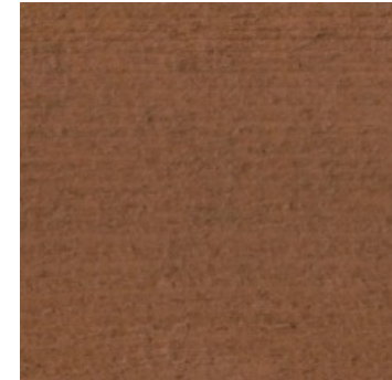
MARSHALLS Old Yorkstone Heritage PC Paving Flags (600x600mm) NEW Slatted Screen Fence to Terrace Area NEW 1800mm High Wood-Stained Treated Timber Close Boarded Fence (Forming Storage Compound and Separating Fence in Garden Area) CUPRONOL Ultimate Garden Preservative Wood Stain Ref: GOLDEN OAK