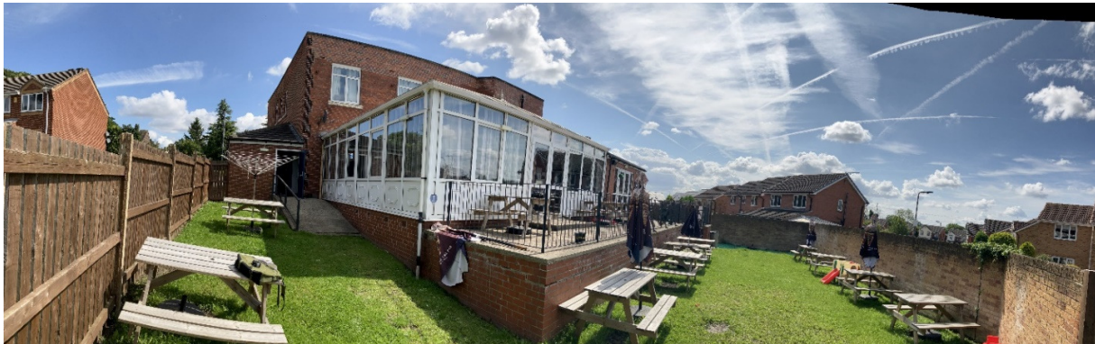
Existing Rear Terrace/ Garden Area

To be Read in Conjunction with ADP Ltd., Drawing No's 1262-02 and 1262-03.