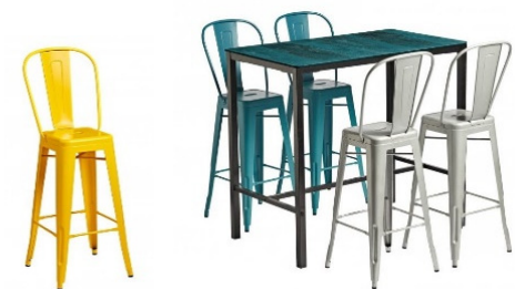
OPTIONAL - ECLIPSE LYON Outdoor Poseur Sets to Raised Terrace Area ( www.eclipsefurniture.co.uk )