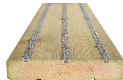
GRIPSURE 'Classic' 150x32mm Treated Timber Decking ( www.gripsure.co.uk )