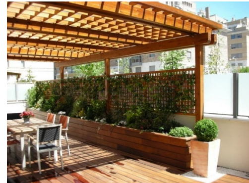
Typical Timber Fixed Frame Pergola