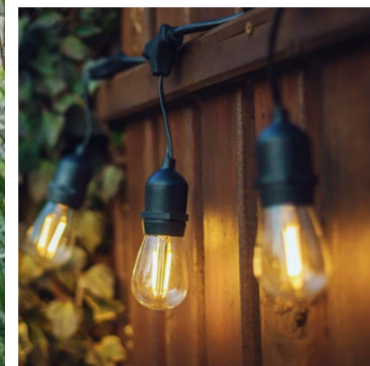
OPTIONAL - Supplementary External Furniture ECLIPSE Beacon 1800mm Round Picnic Benches to Raised Terrace Area Field Style 'Uni-gate' Double Gates www.jacksons-fencing.co.uk OPTIONAL - Core Connectable Festoon Strings Supported on Pergola Posts IP44 Rated Black PVC Cabling 750mm Spacing. S14 LED Festoon Bulb/ B22 Bulb Fitting Shatterproof 1.8-2.2W Warm White 3000k Bulbs Obtainable from ( www.ultraleds.co.uk )