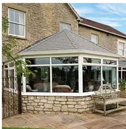
NEW Lightweight Insulated Composite Warm Roof Slate Grey Finish ( www.guardianroofdesign.co.uk )