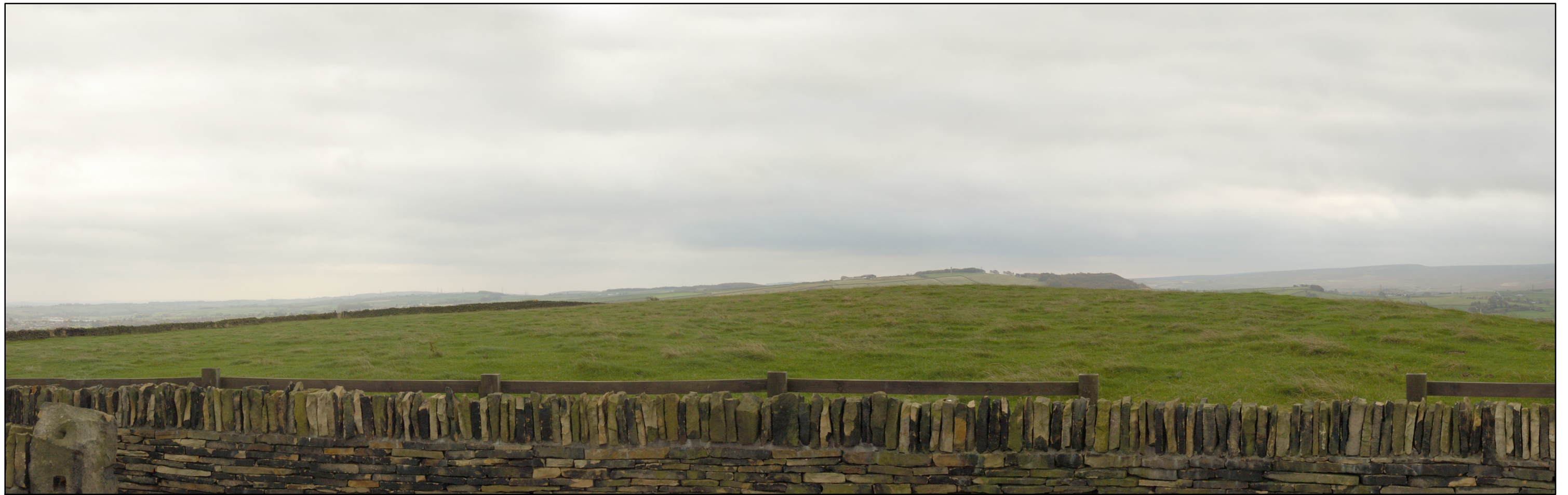
Existing view from viewpoint