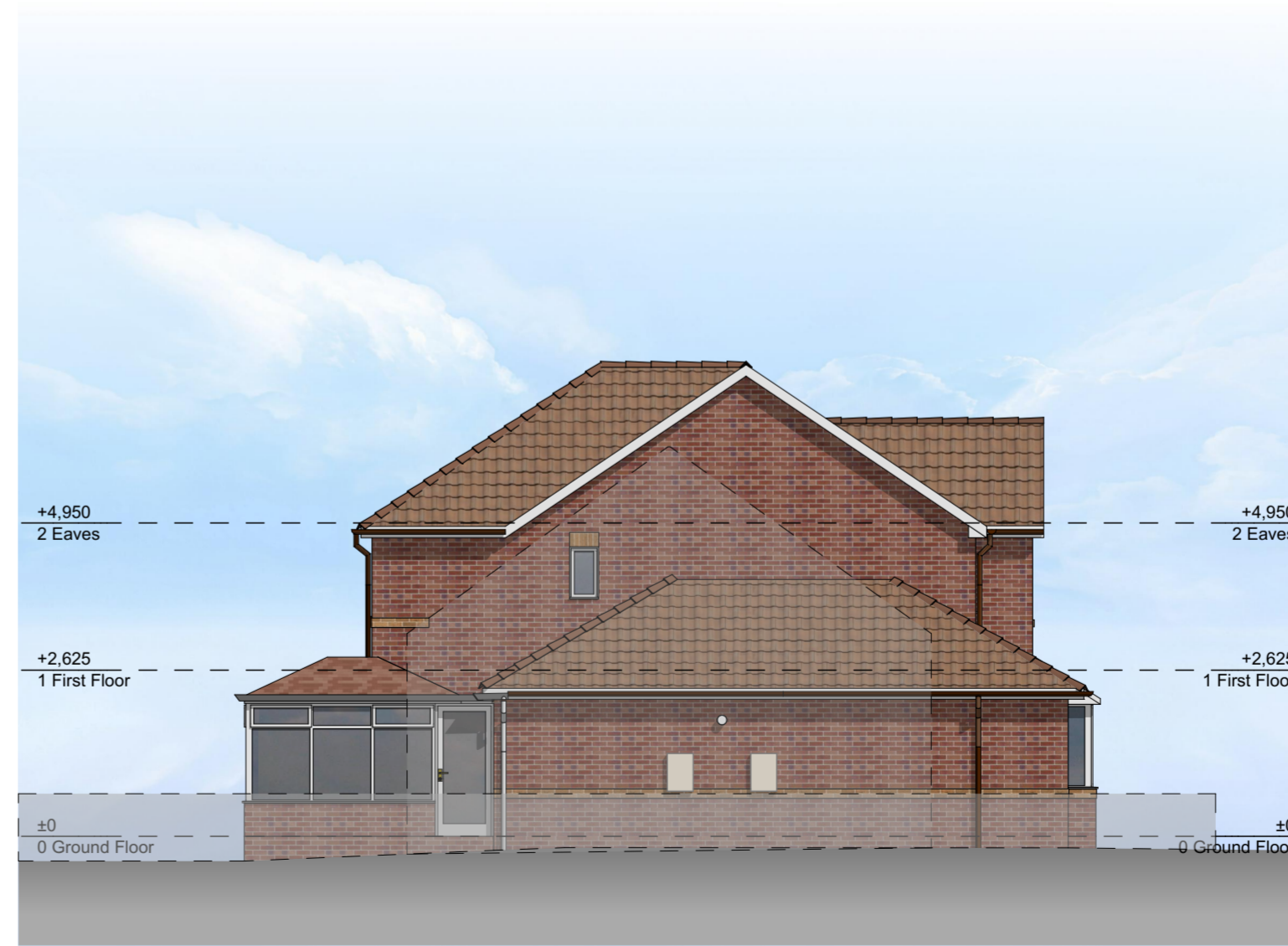
Existing NE Elevation