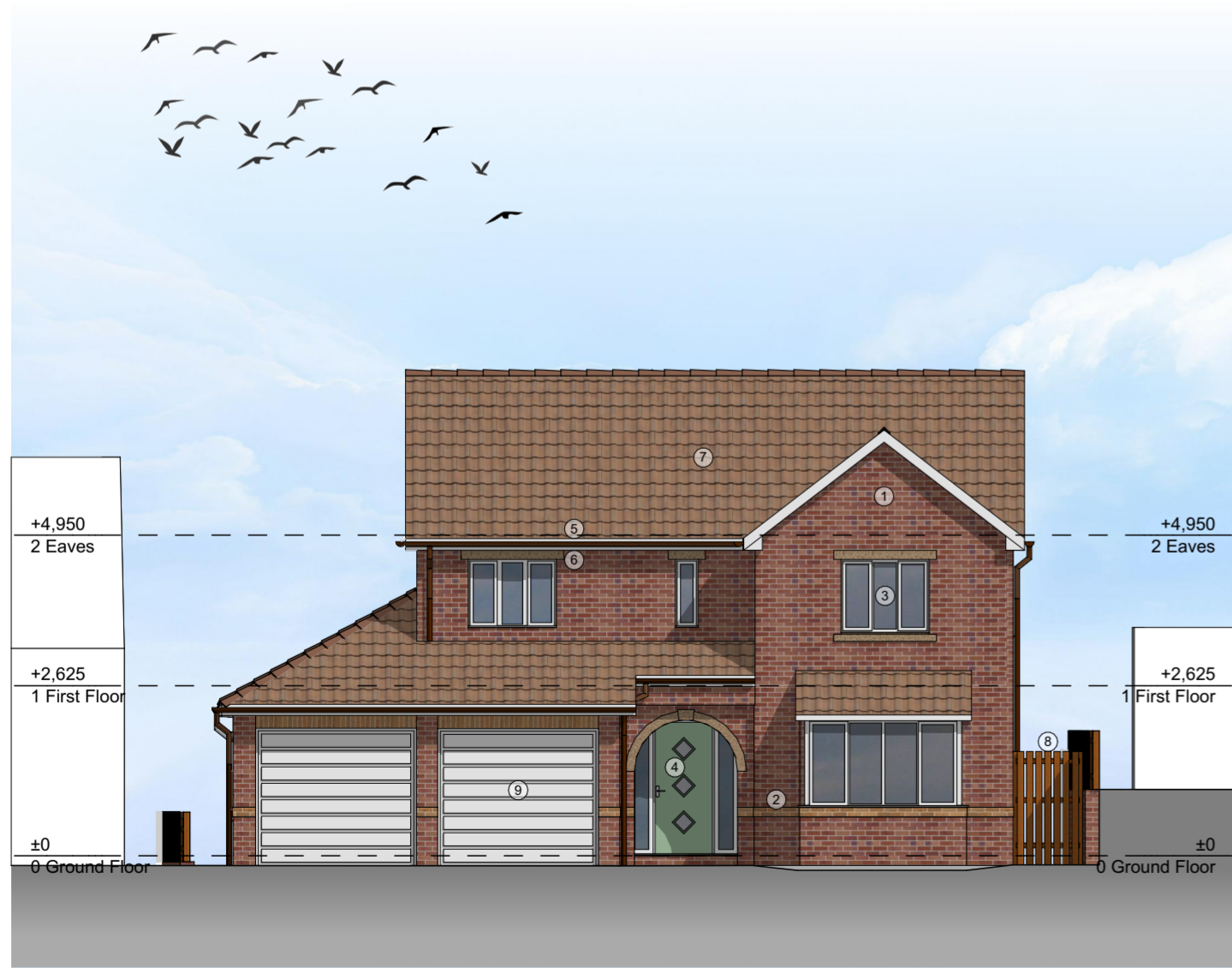
Existing NW Elevation

drwg no & revision 2509-JMA-ZZ-00-DR-A-(03)001B