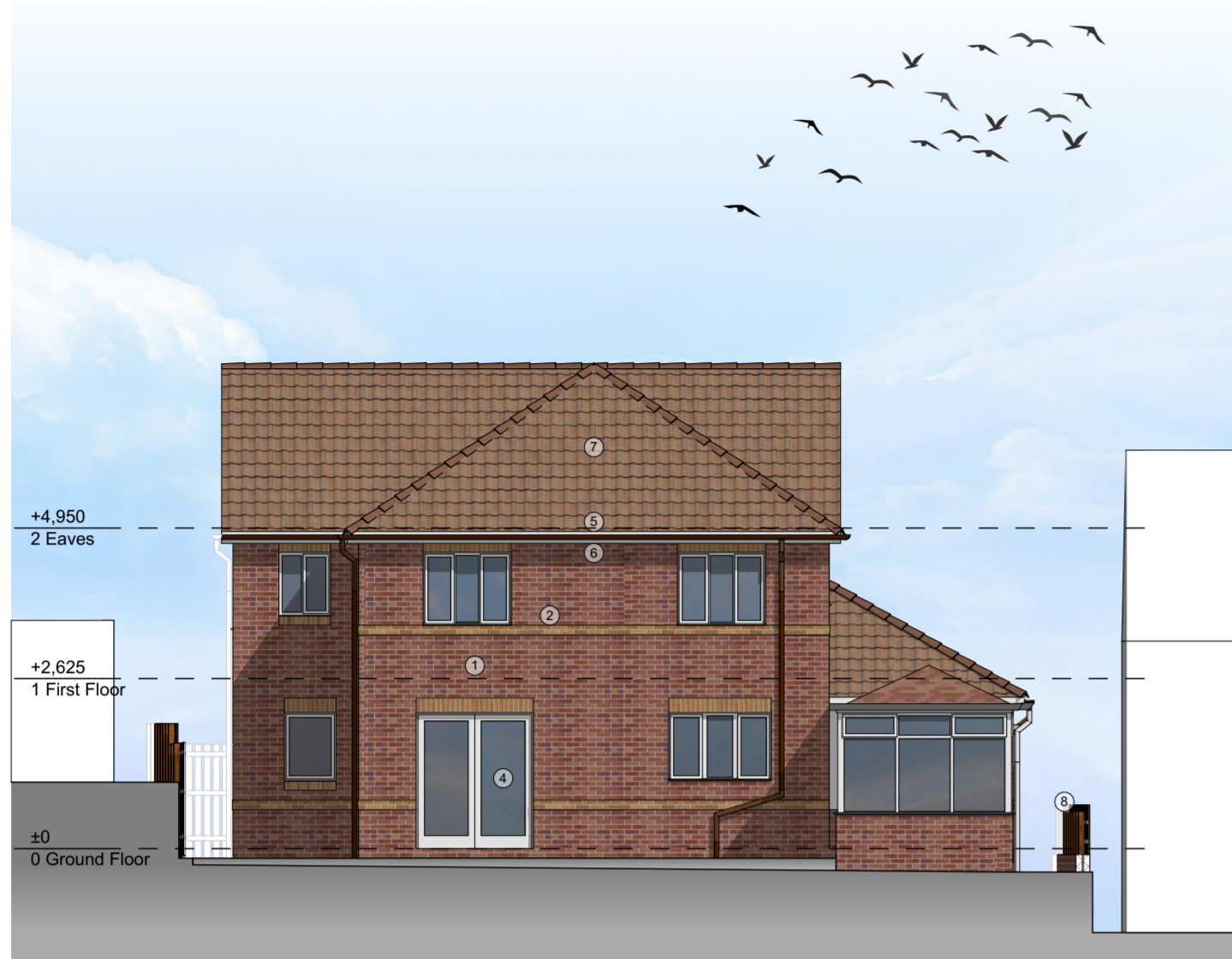
Existing SE Elevation