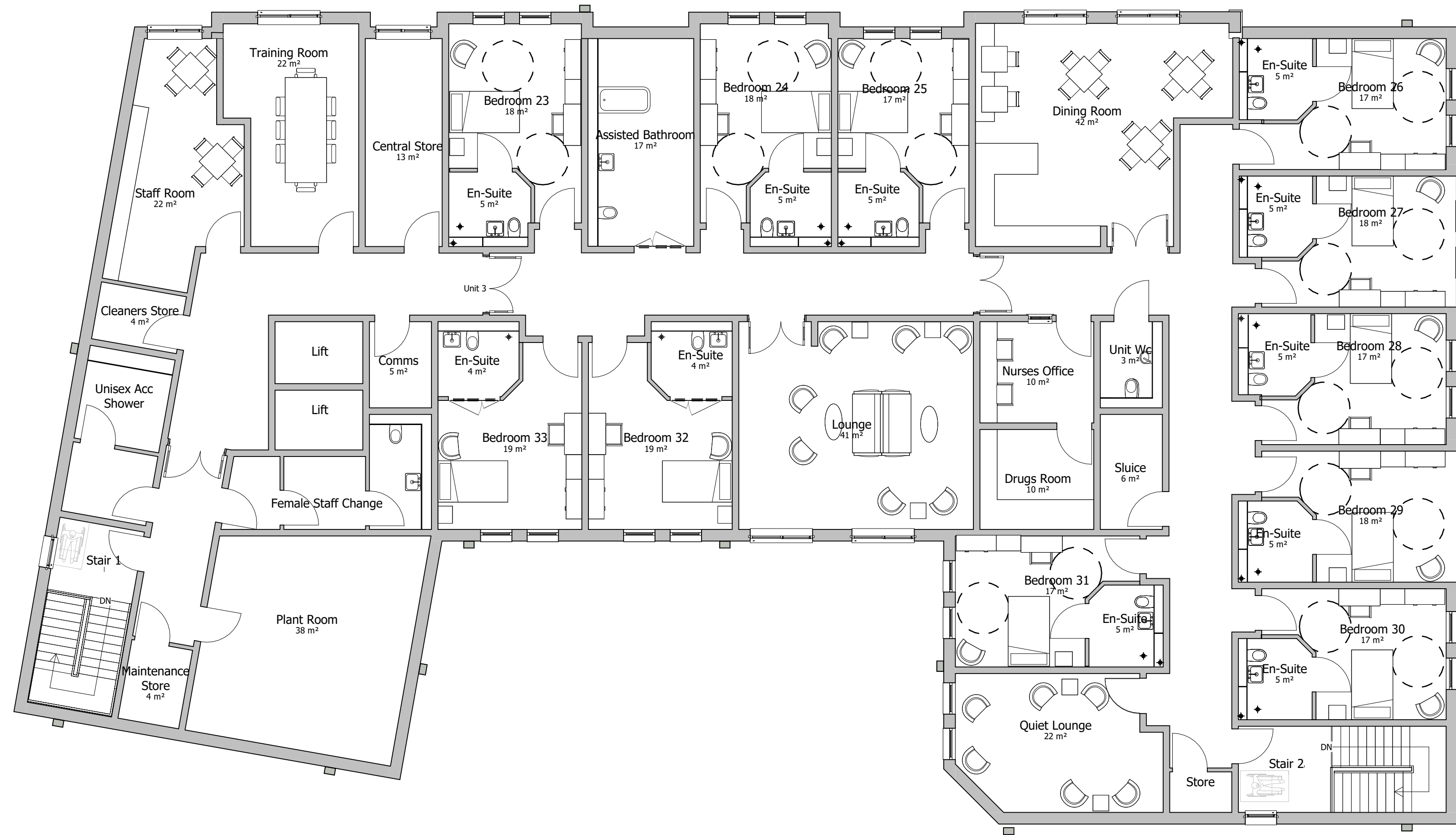
1 | Second Floor Plan 1 : 100

C1 25.01.24 GB NM Revised Following Client Comments