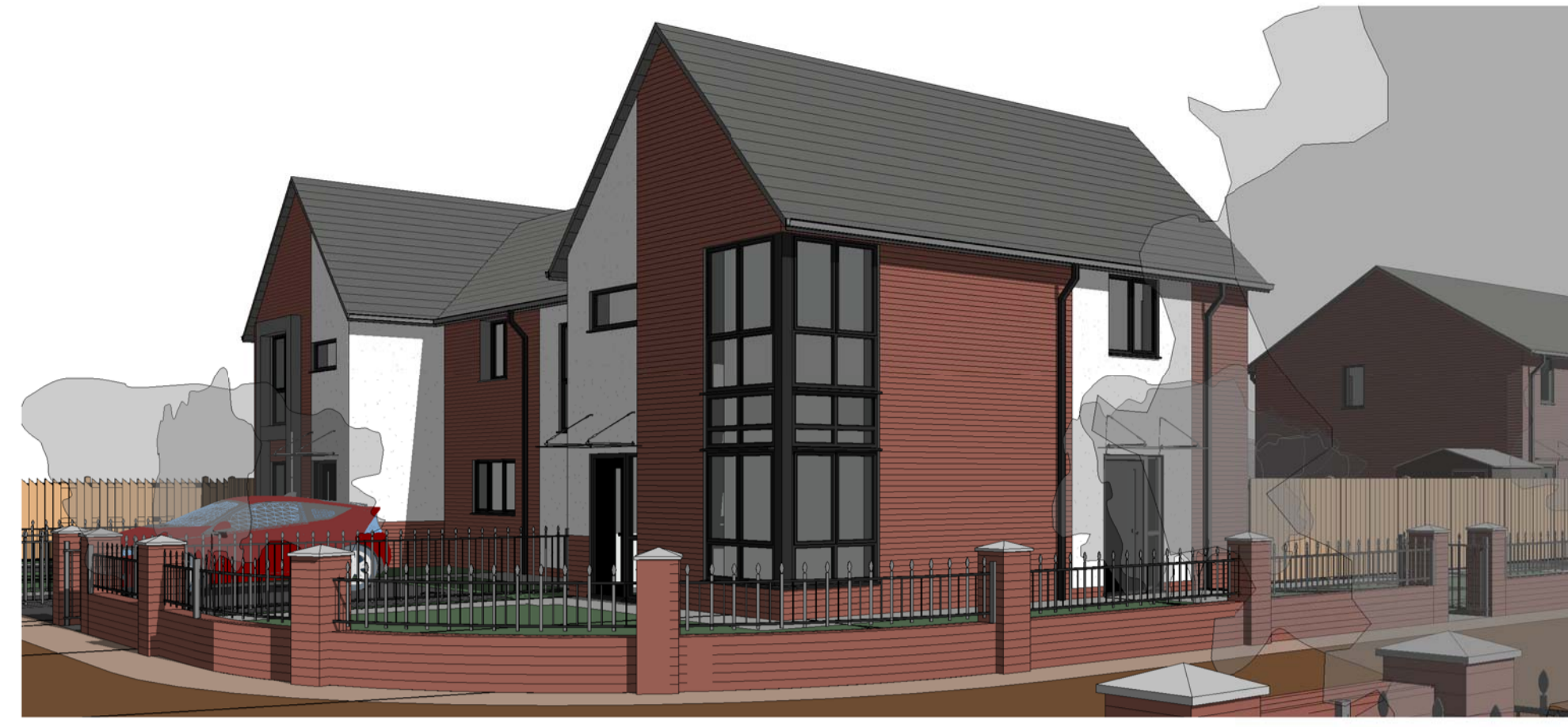
Visualisation of Plot 3