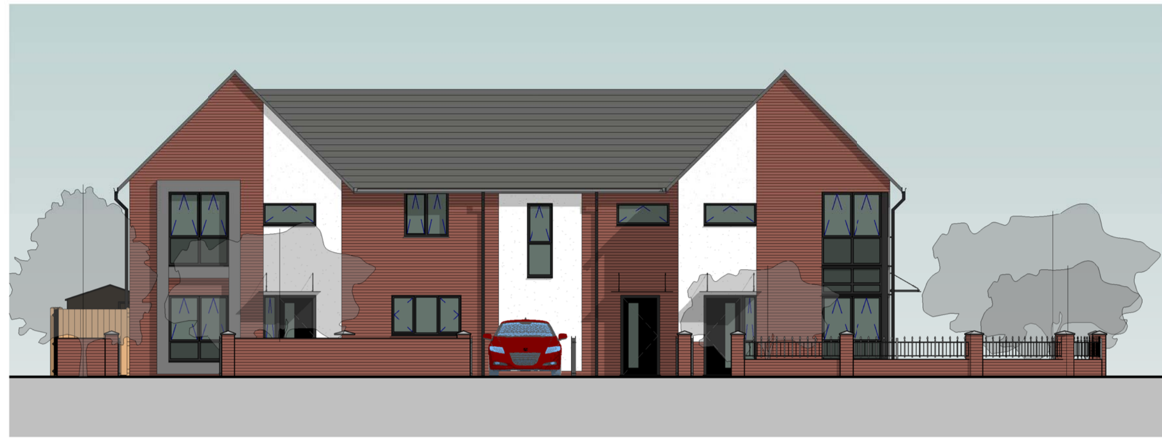
Section 1 - Plots 1 to 3 1 : 100