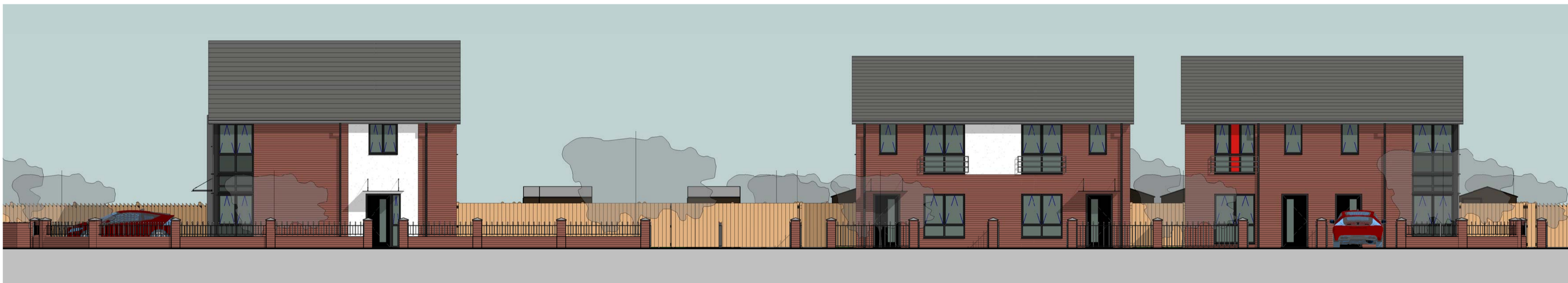
Section 3 - Plots 27 to 30 & Side Elevation to Plot 3 1 : 100