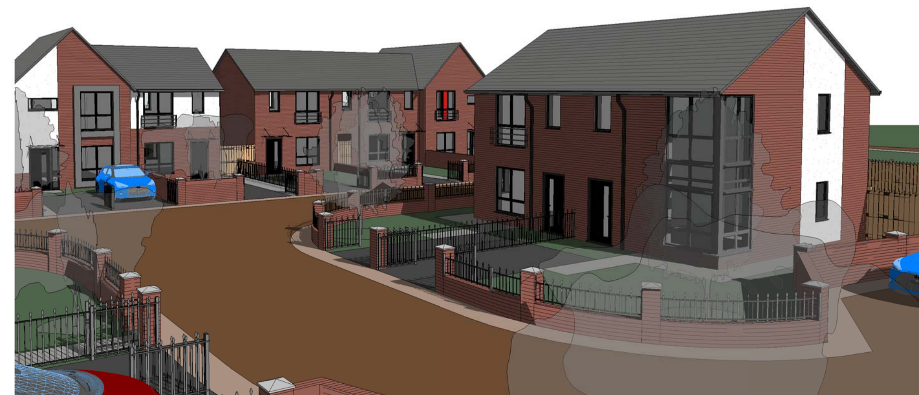
Visualisation looking towards Plots 4 & 5