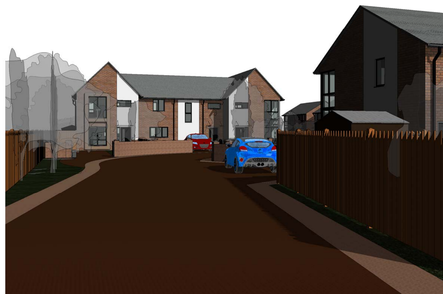
Visualisation looking towards Plots 1, 2 & 3