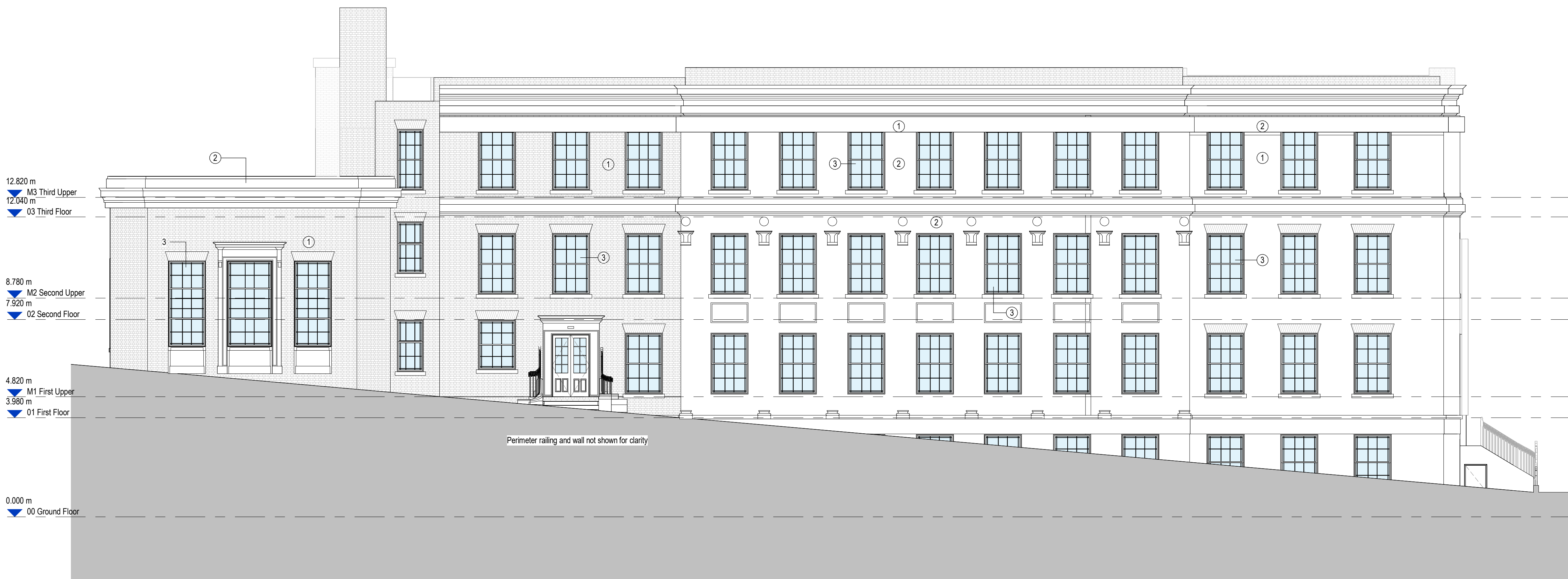
2 Existing GA South Elevation 1 : 100