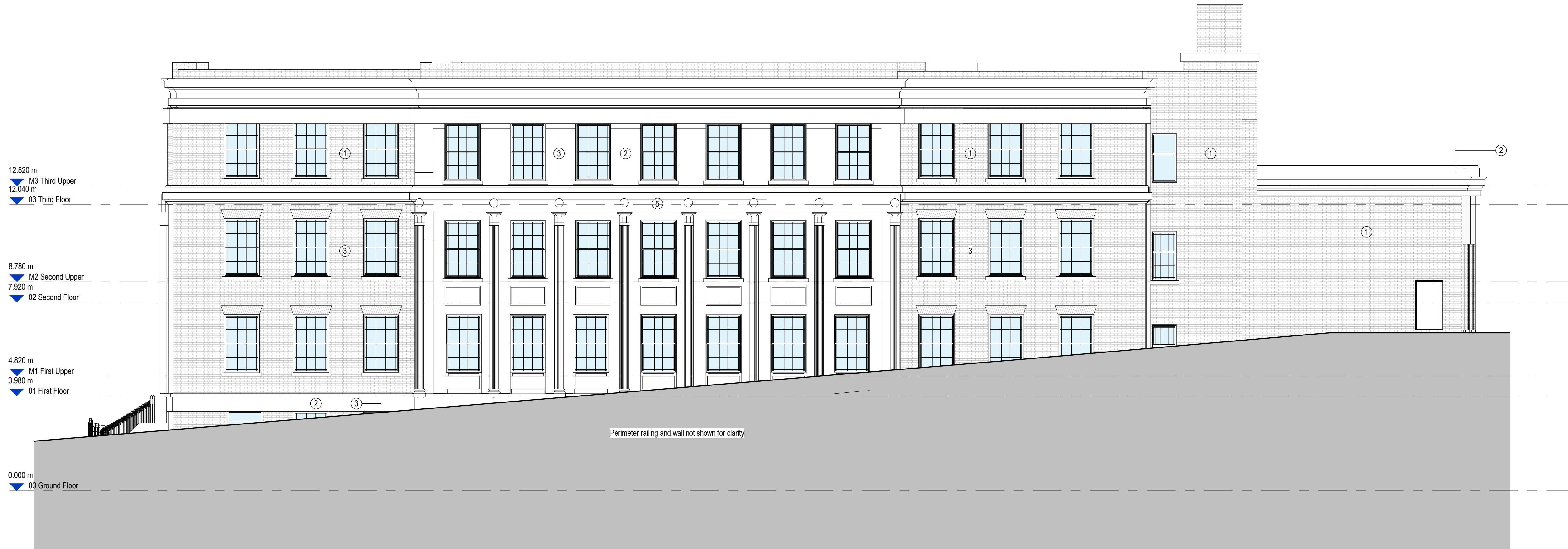
1 Existing GA North Elevation 1 : 100