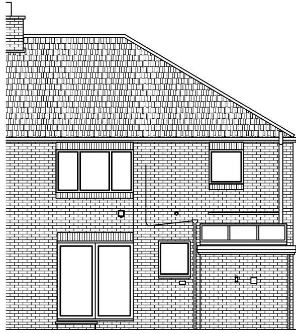
EXISTING REAR ELEVATION SCALE 1:100 AT A3