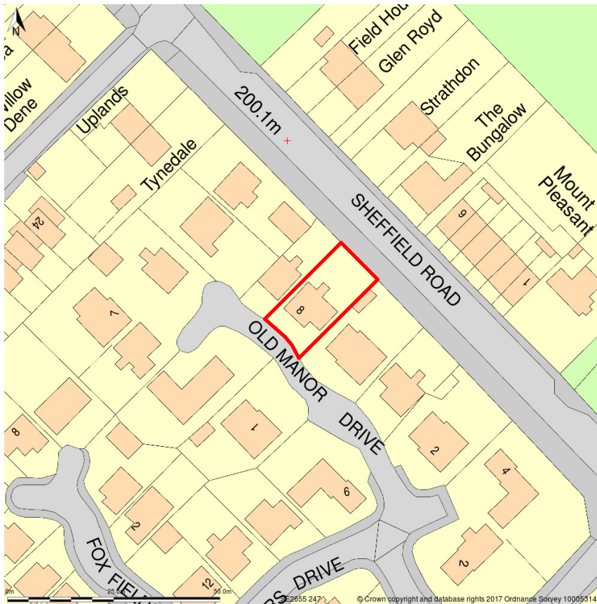
OS Map Scale 1 : 1250